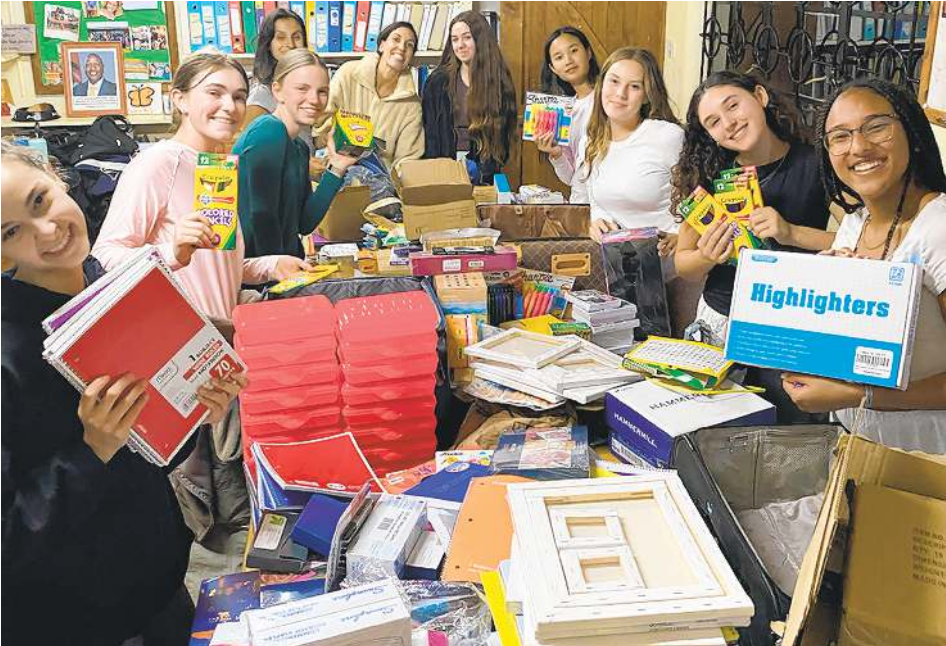
Students from The Grauer School at Daraja Academy unpacking donated school supplies during their Kenyan Connections Expedition.