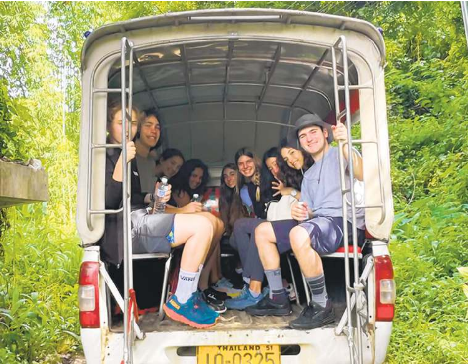
Students from The Grauer School in Thailand during their Thailand Expedition.

Learn more about expeditionary learning opportunities for students at the Discover Grauer Days, where families can visit The Grauer School campus and classrooms while school is in session. For more information and to RSVP, visit grauerschool.com/admissions/visit-grauer . — The Grauer School news release