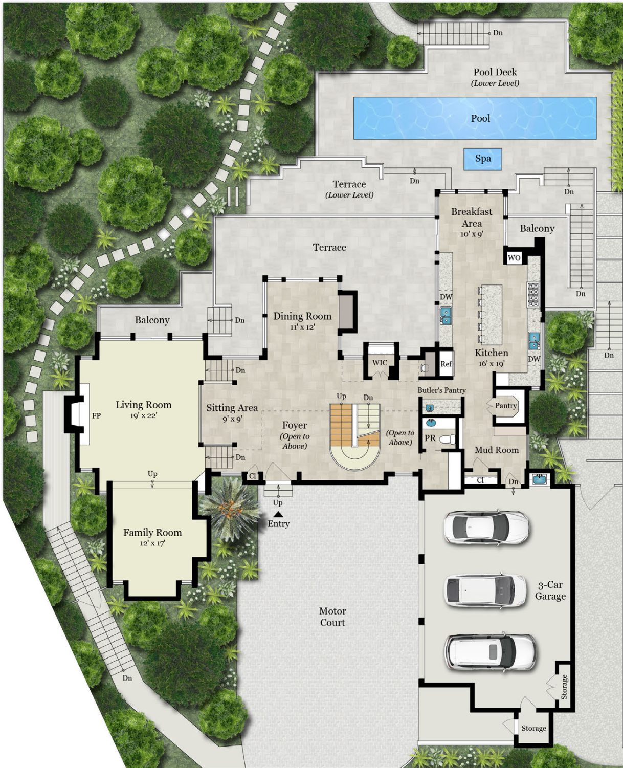
MAIN LEVEL 2,220 SQ FT