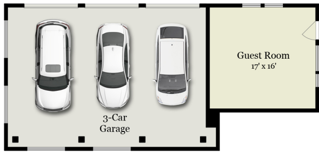
DETACHED GARAGE/GUEST HOUSE 720 (Unfinished) - 295 SQ FT (Finished)