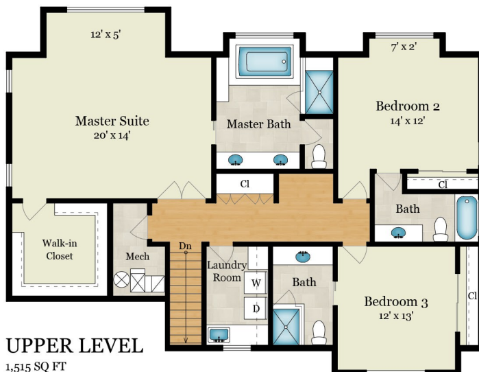
UPPER LEVEL 1,515 SQ FT