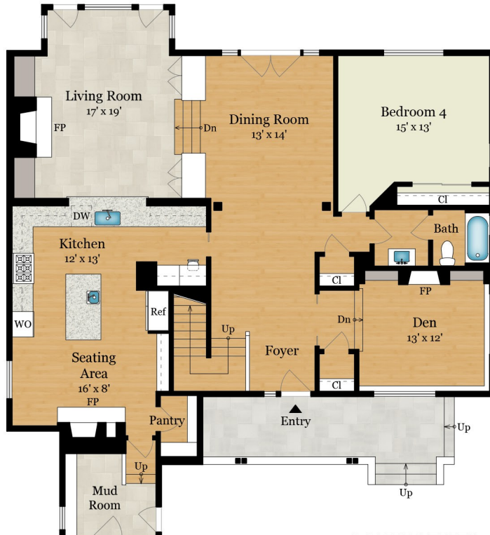
MAIN LEVEL 1,905 SQ FT

Estimated Total Finished Square Footage: 3,750 SQ FT