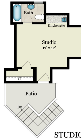
STUDIO (ABOVE GARAGE) 330 SQ FT