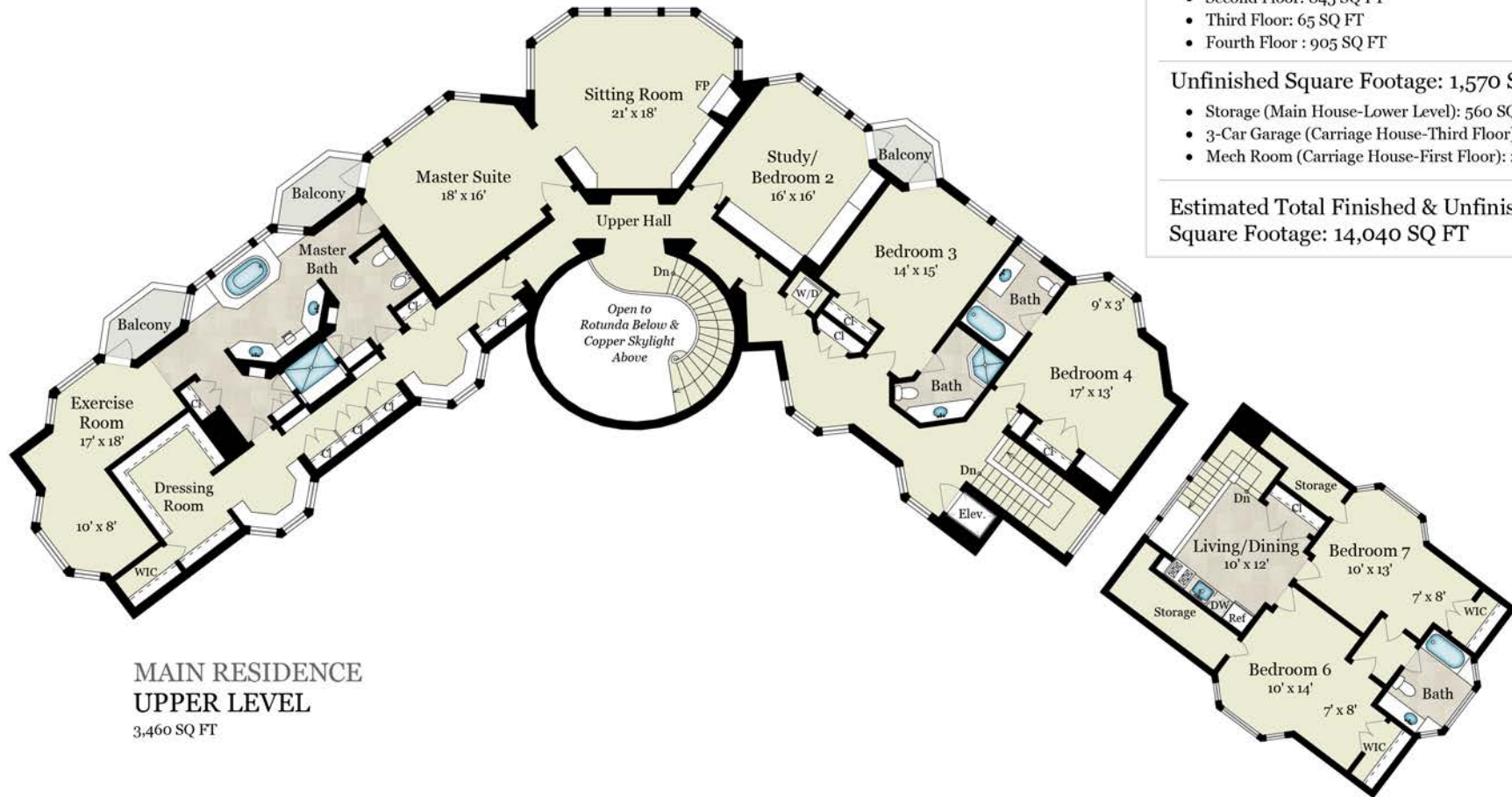
MAIN RESIDENCE UPPER LEVEL 3,460 SQ FT

Estimated Total Finished & Unfinished Square Footage: 14,040 SQ FT