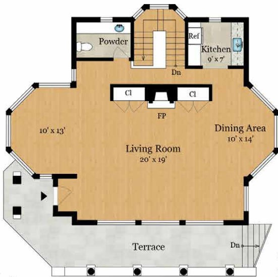
GUEST HOUSE MAIN LEVEL 1,085 SQ FT