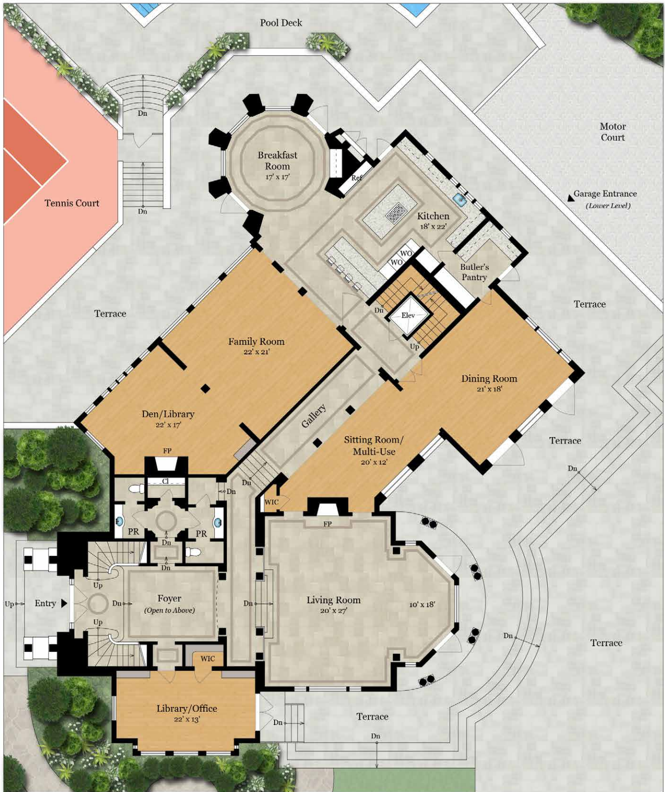
MAIN RESIDENCE MAIN LEVEL 4,915 SQ FT