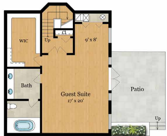
GUEST HOUSE LOWER LEVEL 885 SQ FT