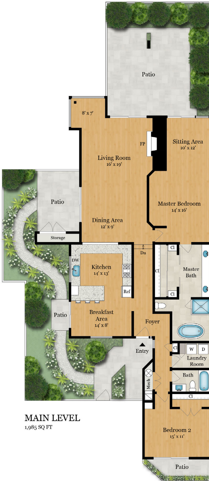
MAIN LEVEL 1,985 SQ FT