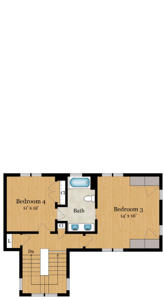
UPPER LEVEL 710 SQ FT