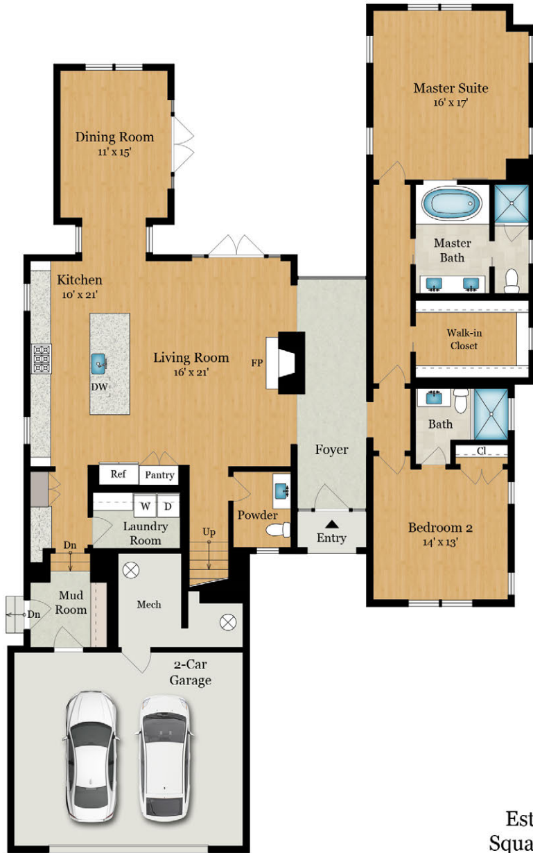
MAIN LEVEL 2,400 SQ FT