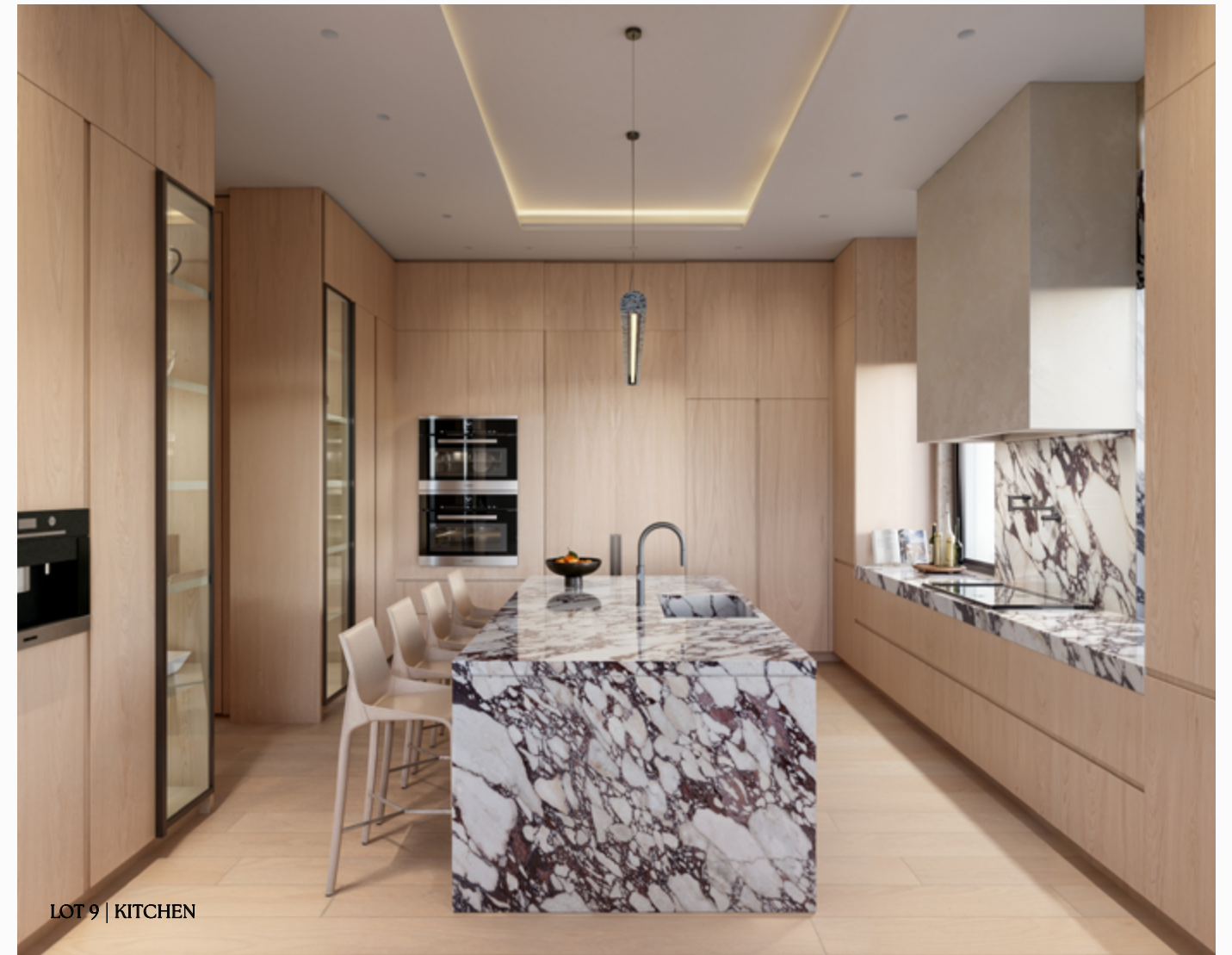
LOT 9 | KITCHEN