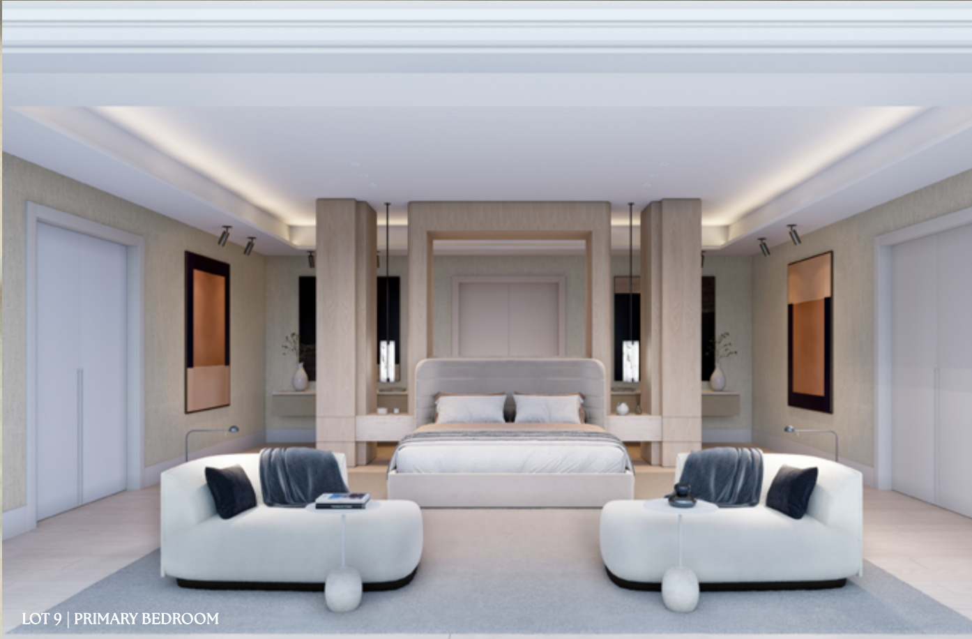
LOT 9 | PRIMARY BEDROOM