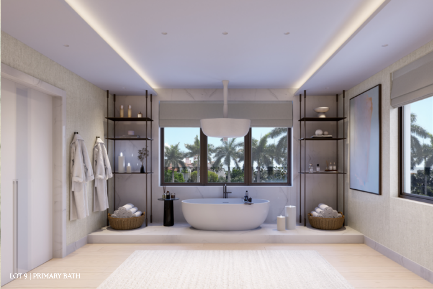
LOT 9 | PRIMARY BATH