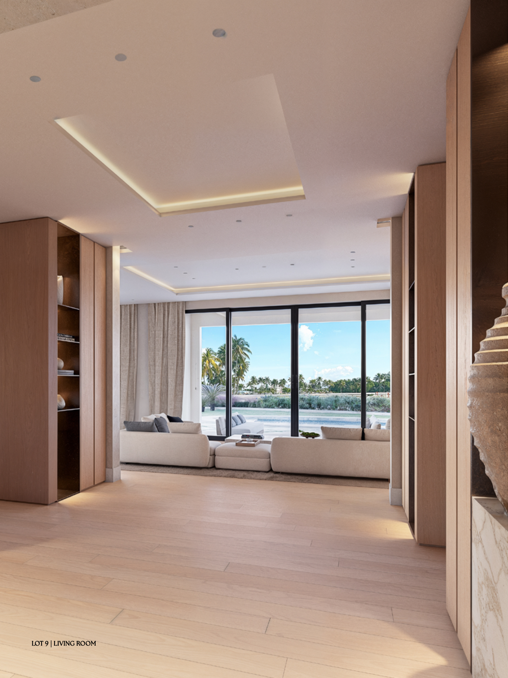
LOT 9 | LIVING ROOM