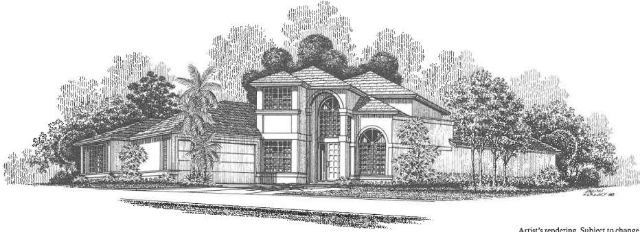
Artist's rendering. Subject to change.