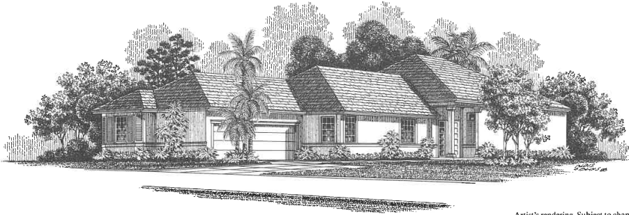
Artist's rendering. Subject to change.