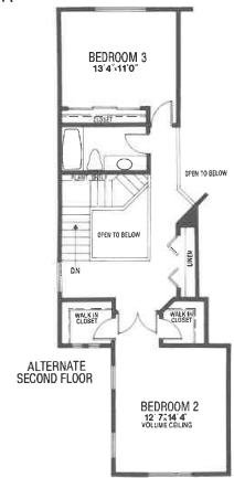
ALTERNATE SECOND FLOOR

All dimensions are approximate. Preliminary floor plan is subject to change without notice.