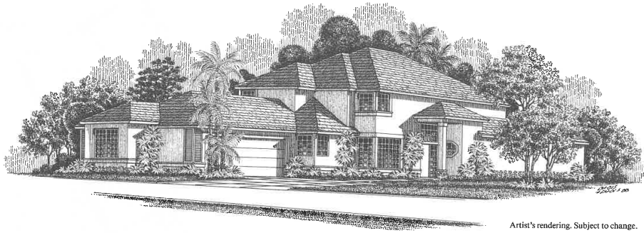
Artist's rendering. Subject to change.

Laurel 3 BEDROOMS 3½ BATHS 2,285 SQUARE FEET LIVING AREA