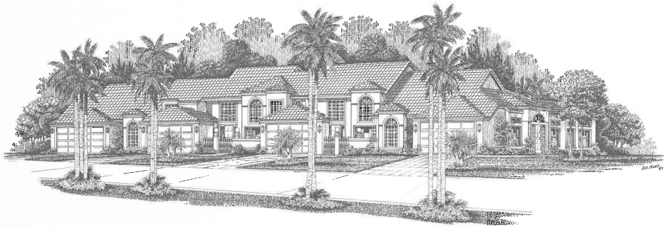
Carolina - III 3 BEDROOM 4 BATH/DEN 3,130 SQUARE FEET LIVING AREA

The Cloisters are being built by Arvida's builders division. Arvida/JMB Partners is the developer of Broken Sound.