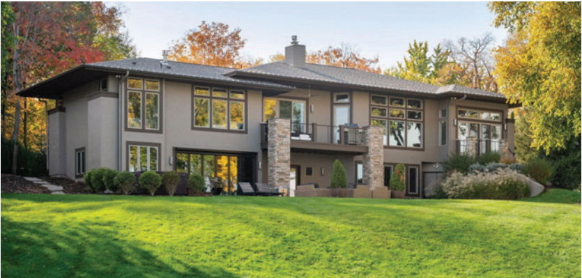
2696 CAROLINE AVENUE | ORONO 4 BR 5 BA | $3,595,000

GREGG LARSEN 612.719.4477 glarsen@cbburnet.com gregglarsenhomes.com