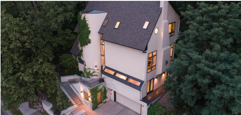
915 KENWOOD PARKWAY | MINNEAPOLIS 4 BR 5 BA | $1,195,000

This glass-wrapped corner unit perfectly melds within the dramatic urban texture and expertly balances light, water and greenery - creating sense of calm and intimacy. Well-appointed kitchen, luxurious finishes and impressive water vistas.