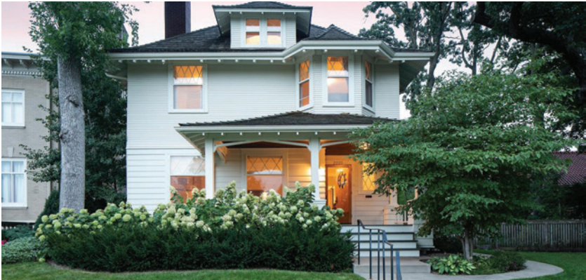
2225 E. LAKE OF THE ISLES PARKWAY | MINNEAPOLIS 4 BR 4 BA | $3,380,000

Custom designed unit with a refined material palette, sleek sight lines, luxurious finishes and panoramic windows, this expertly crafted space provides a tranquil urban retreat. Open concept living, extensive built-ins and two outdoor spaces.