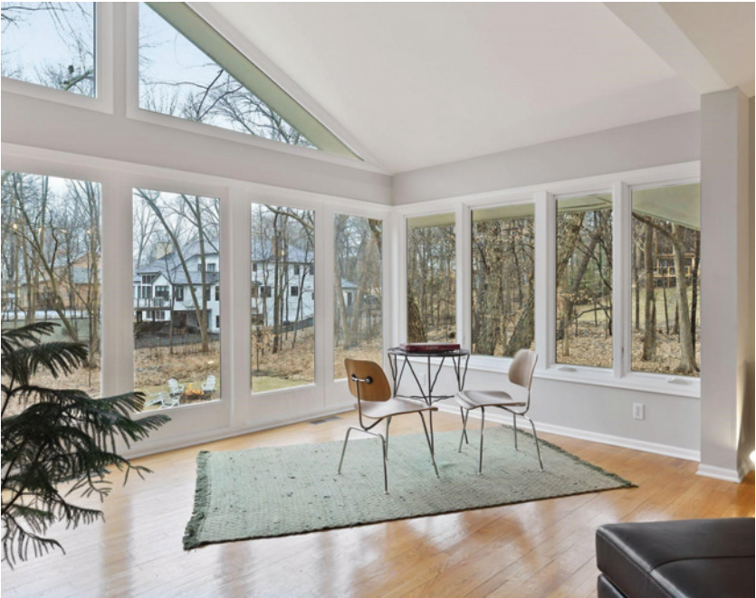
20565 LINDEN ROAD | DEEPAVEN 4 BR 2 BA | $1,275,000

Unique light-filled Cottagewood home on a private 1+ acre wooded lot. Mid Century Modern with clean lines, open floorplan and elegant simplicity. Vaulted & beamed ceilings and walls of windows in living room & dining room. Updated kitchen enjoys bright white cabinetry, granite counter tops, center island and stainless-steel appliances.