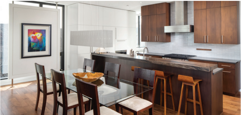
1805 W. LAKE STREET UNIT 301 | MINNEAPOLIS 2 BR 2 BA | $1,300,000

Located on prestigious Lake Harriet Parkway, this luxurious residence offers panoramic water and woodland vistas. Gracious lake facing public and private spaces, beautiful main floor family room with wall to wall windows and luxe owner's wing.