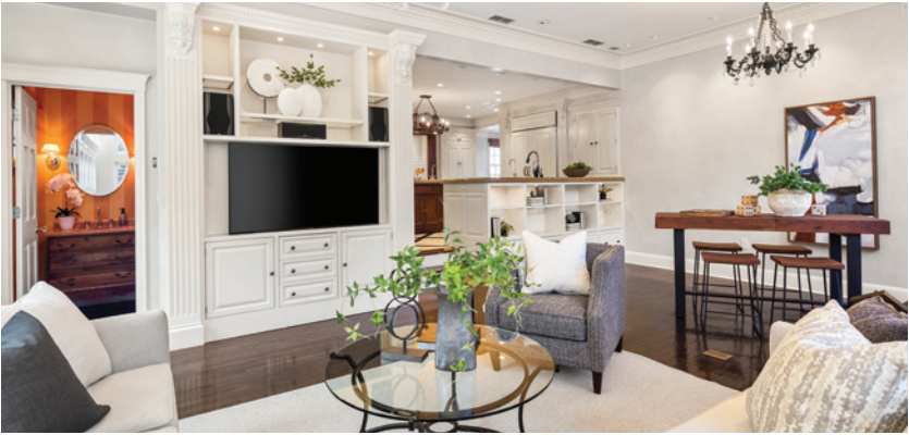
4309 E. LAKE HARRIET PARKWAY | MINNEAPOLIS 5 BR 5 BA | $1,895,000

This signature home located in prized Rolling Green of Edina is surrounded by perfectly placed verdant gardens and lush privacy landscaping. Offering elegant designer finishes, marble wrapped kitchen, theater, elevator and inground pool.