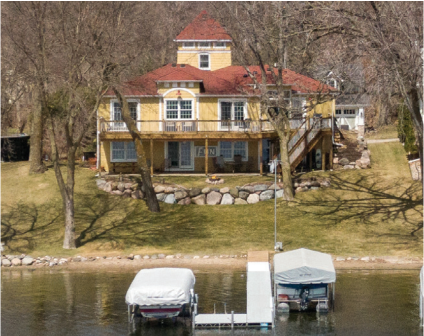
3637 SOUTH CEDAR DRIVE | CHANHASSEN 4 BR 4 BA | $1,595,000

Enjoy the very best of lake living with 70-feet of level, sandy, south-facing shoreline on sought-after Lake Minnewashta. This is a really special home, completely rebuilt in 2004, warm, welcoming and designed specifically for relaxed lake front living with endless water views. Located in Minnetonka Schools.