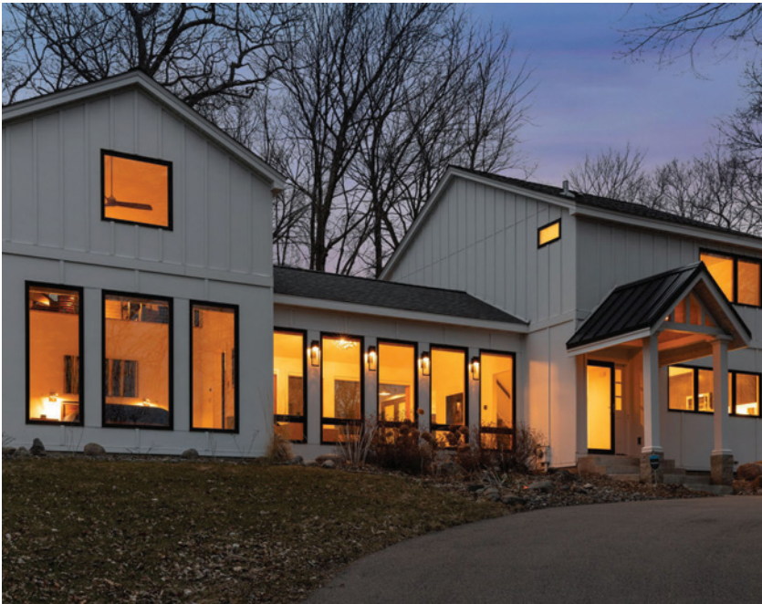
5885 LORING DRIVE | MINNETRISTA 4 BR 3 BA | $1,050,000

Sited on a private, cul-de-sac lot, this custom, Kroiss built home, blends sophisticated design with the highest quality craftsmanship to create a compelling main-level living experience! Enjoy resort-style living with masterful gardens, an inground pool, pergola and hot tub. Located in Minnetonka Schools.