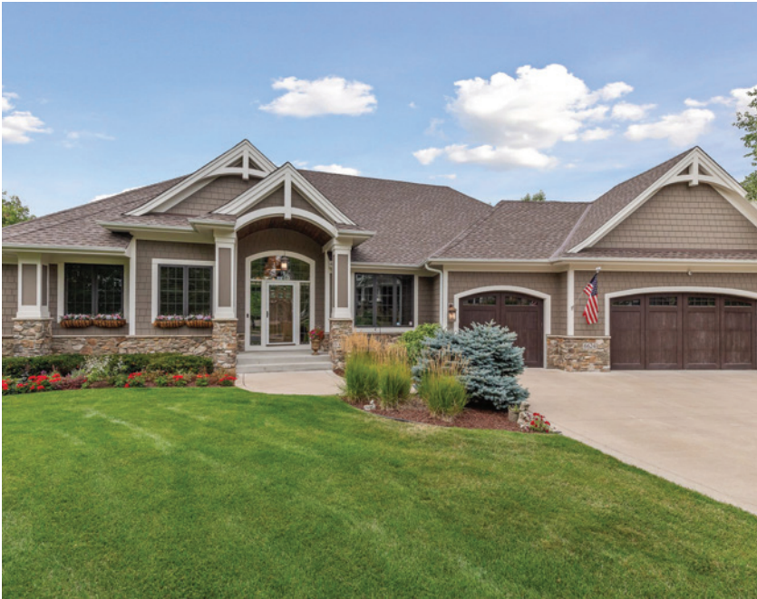
6624 ALDER WAY | CHANHASSEN 4 BR 4 BA | $1,250,000

Timeless and refined. This custom home built by Gray's Bay Builders offers gorgeous woodwork and designer finishes that blend to create warm and inviting spaces. Perfect for Minnesota summers, the backyard is a private retreat with a heated, salt-water pool surrounded by stamped concrete patios and firepit.