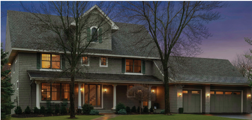
17900 6TH AVENUE N. | PLYMOUTH 5 BR 4 BA | $1,100,000

Turn-key cottage style home in premier Howard's Point neighborhood. One-level living with exceptional detailing throughout. Timeless, nautical style with enameled shiplap surfaces, reclaimed wood beams, custom cabinetry and hardwood floors.