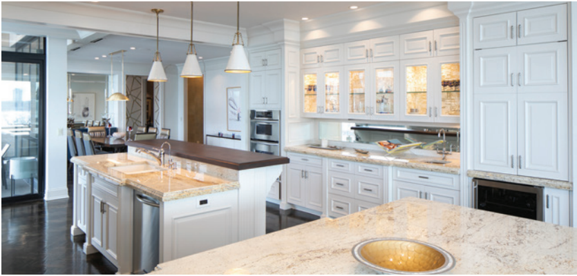
1805 W. LAKE STREET UNIT 302 | MINNEAPOLIS 2 BR 2 BA | $1,685,000

A thoughtful renovation/addition of a historic Lake of the Isles residence with walls of windows that effortlessly meld the tranquil outdoors, Japanese inspired gardens and picturesque water views with creatively designed interior spaces.