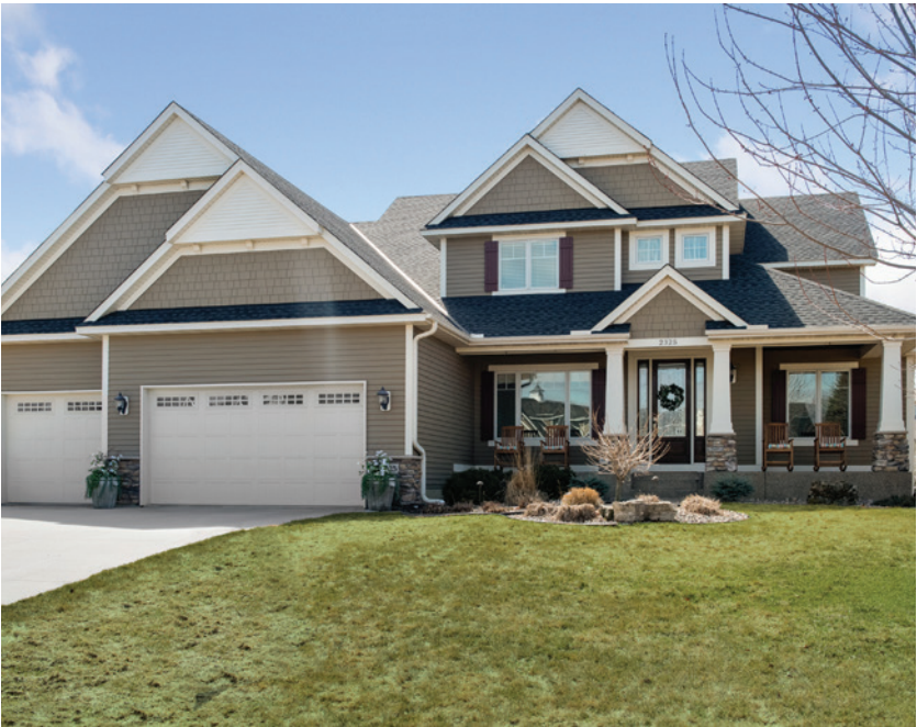
2325 ISLAND POINT | VICTORIA 4 BR 5 BA | $1,075,000

Enjoy the very best of lake living with 70-feet of level, sandy, south-facing shoreline on sought-after Lake Minnewashta. This is a really special home, completely rebuilt in 2004, warm, welcoming and designed specifically for relaxed lake front living with endless water views. Located in Minnetonka Schools.