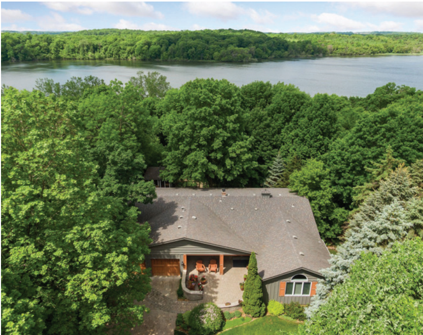
7100 ROLLING ACRES ROAD | EXCELSIOR 3 BR 3 BA | $1,010,000

Exceptional One-Story located in beautiful Trillium Bay! Deeded access to Lake Minnetonka, walking trails, day dock, a park & sandy beach, deluxe master suite, gourmet kitchen, library, screened porch, walk out lower level, & a private 1.8 acre lot.