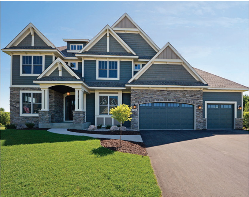
7000 W. 175TH AVENUE | EDEN PRAIRIE 5 BR 6 BA | PRICE UPON REQUEST

Unique light-filled Cottagewood home on a private 1+ acre wooded lot. Mid Century Modern with clean lines, open floorplan and elegant simplicity. Vaulted & beamed ceilings and walls of windows in living room & dining room. Updated kitchen enjoys bright white cabinetry, granite counter tops, center island and stainless-steel appliances.