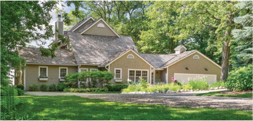
1375 PARK DRIVE | ORONO 4 BR 4 BA | $2,299,900

Stunning Lake Minnetonka lakefront home. Hard to find level lot with clear water, sandy beach and miles of views. Nearly new condition, this home features an open design with soaring vaults, large windows and high-level finishes throughout.