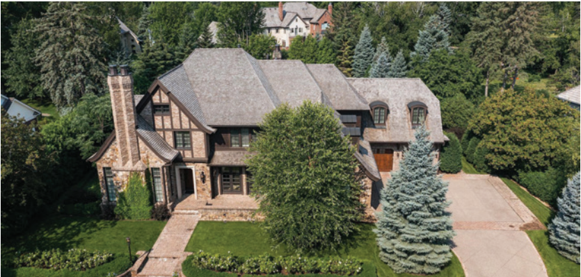
4908 ROLLING GREEN PARKWAY | EDINA 5 BR 8 BA | $5,500,000

BRUCE BIRKELAND 612.414.3957 BBirkeland@cbburnet.com BruceBirkelandGroup.com