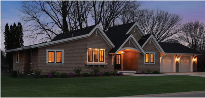
5815 HOWARDS POINT ROAD | SHOREWOOD 4 BR 3 BA | $1,049,900

Spectacular estate setting on Carson's Bay. Over one acre and 109' of west-facing lakefront. Gently sloping lawn with towering hardwoods, clear water and sunset views over Minnetonka Yacht Club Island and beyond.