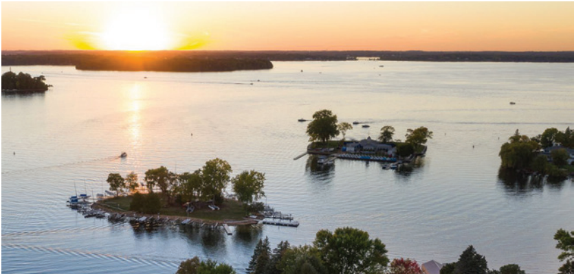
19270 DALE AVENUE | DEEPHAVEN 4 BR 4 BA | $3,499,000

Welcome to Orchard Creek – A small, 5 lot community with almost 40 acres adjacent to the Luce Line Trail. This development has a unique combination of rolling hills, dense woods and long southerly views over wetlands. Orono Schools.