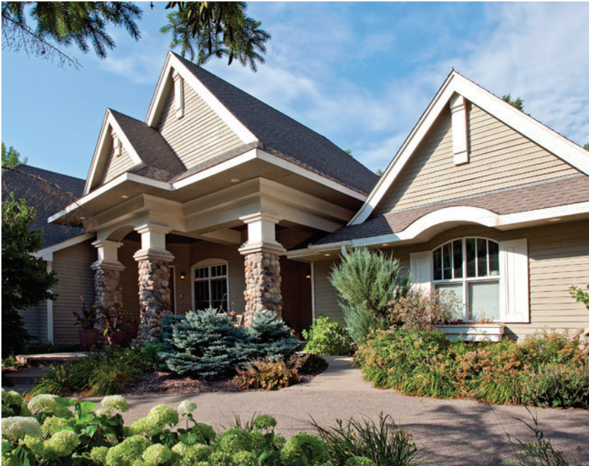
4295 TRILLIUM LANE W. | MINNETRISTA 4 BR 4 BA | $1,200,000

Neighborhood's premier lot on a cul-de-sac w/wonderful backyard views. 2 gas fireplaces. Chef's kitchen w/huge island, formal & informal dining areas + huge deck for entertaining. Spa-like master, 4BRs up (all w/walk ins and ensuites). Finished walkout lower w/sunken media area, wet bar, multiple entertaining spaces.