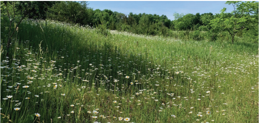
1685 ORCHARD CREEK TRAIL | ORONO LOT/LAND | $799,900

New England cottage sited on over an acre of rolling lawn and 100' of lakeshore on Lake Minnetonka. Floor-to-ceiling windows showcase panoramic lake views and deep summer sunsets. Quiet, neighborhood setting on Forest Lake Bay!