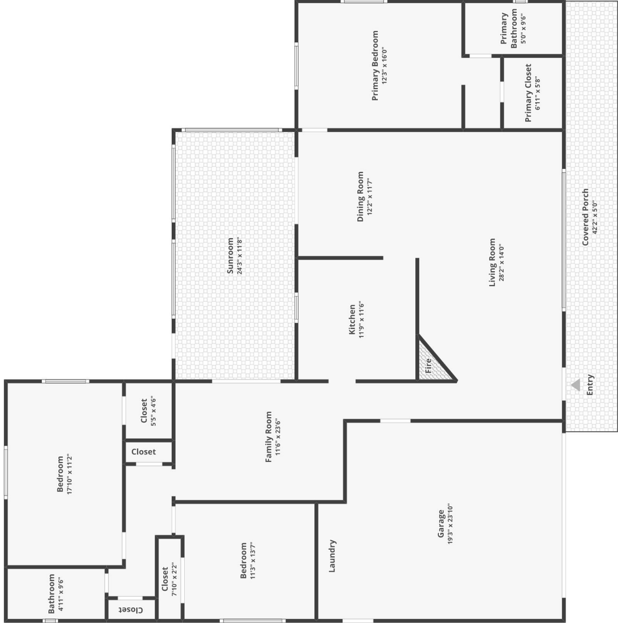
290 Carissa Dr, Satellite Beach, FL 32937 Floor 1

Floor plans/tour cannot be used for building or design purposes. Sizes and dimensions are approximate.