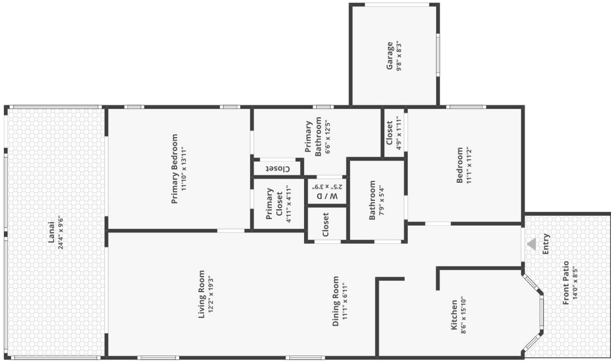
761 Plantation Dr, Titusville, FL 32780 Floor 1

Floor plans/tour cannot be used for building or design purposes. Sizes and dimensions are approximate.