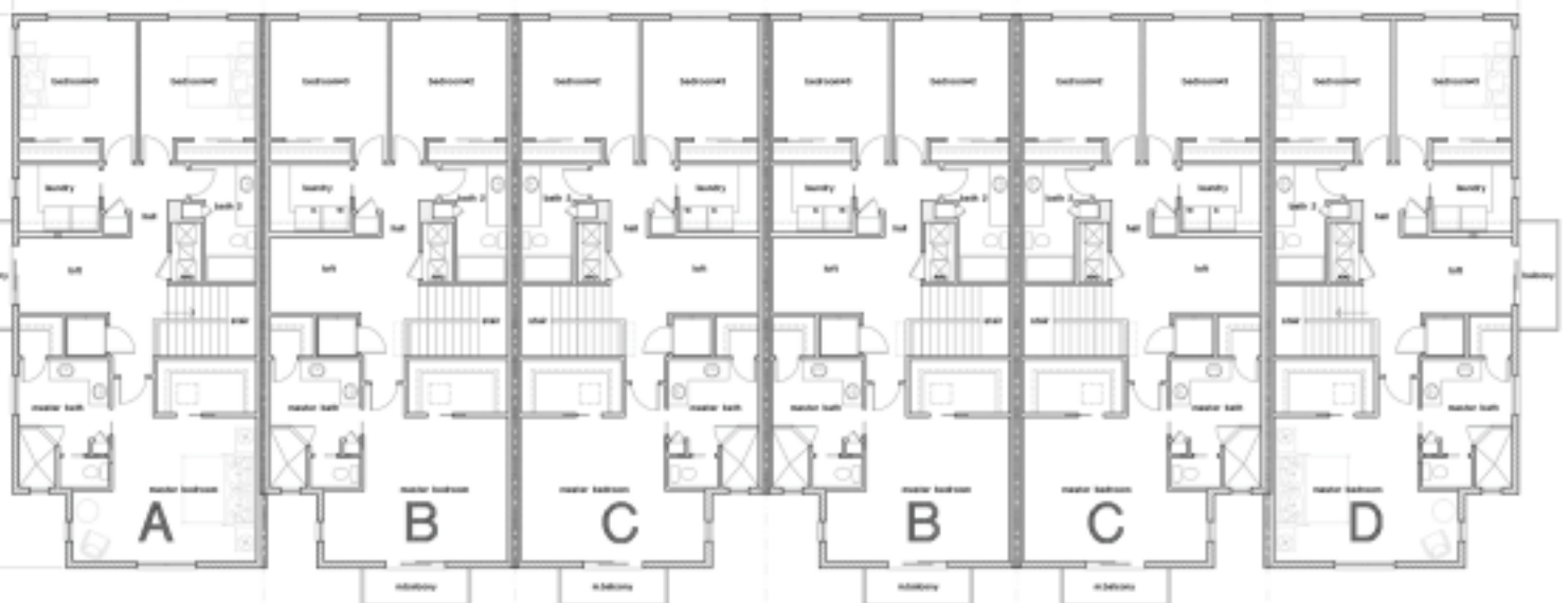
OVERALL SECOND FLOOR PLAN

All dimensions and specifications (including square footages) are approximate and provided for comparison purposes only and are subject to change in the sole discretion of the developer and should not be relied upon when making a decision to purchase a home. Actual areas may be smaller. Maps, site plans, floor plans, sketches, drawings and elevations are artist renderings and are for informational purposes only and subject to change without notice.