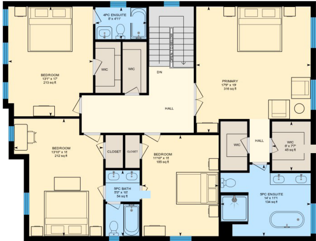
2nd Floor Exterior Exclude