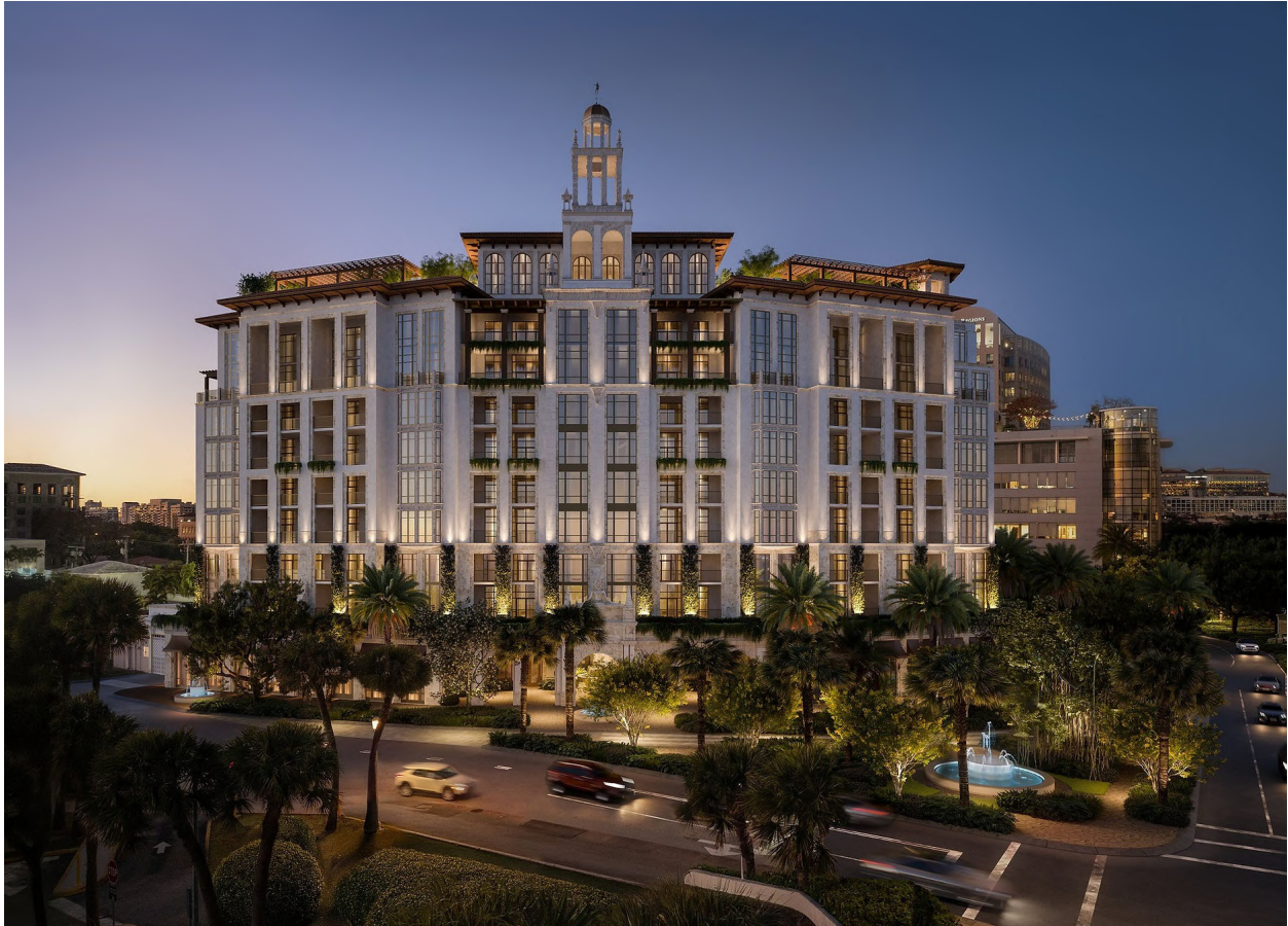
Ponce Park

Founded in 2015 in Madrid’s prestigious Barrio de Salamanca, Quintín Ultramarinos began as a traditional Spanish gourmet market before evolving into one of the city’s most recognized all-day dining destinations. Known for blending historic Spanish culinary traditions with a contemporary, design-forward atmosphere, the concept serves breakfast, lunch, and dinner alongside a wine program highlighting both Spanish and international selections.