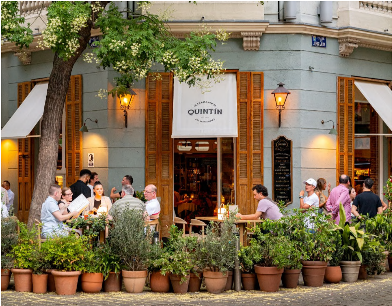
Quintín Ultramarinos Madrid

Developed by The Allen Morris Company, Ponce Park will bring the acclaimed Madrid institution to its 11-story Mediterranean-inspired condominium rising in the heart of