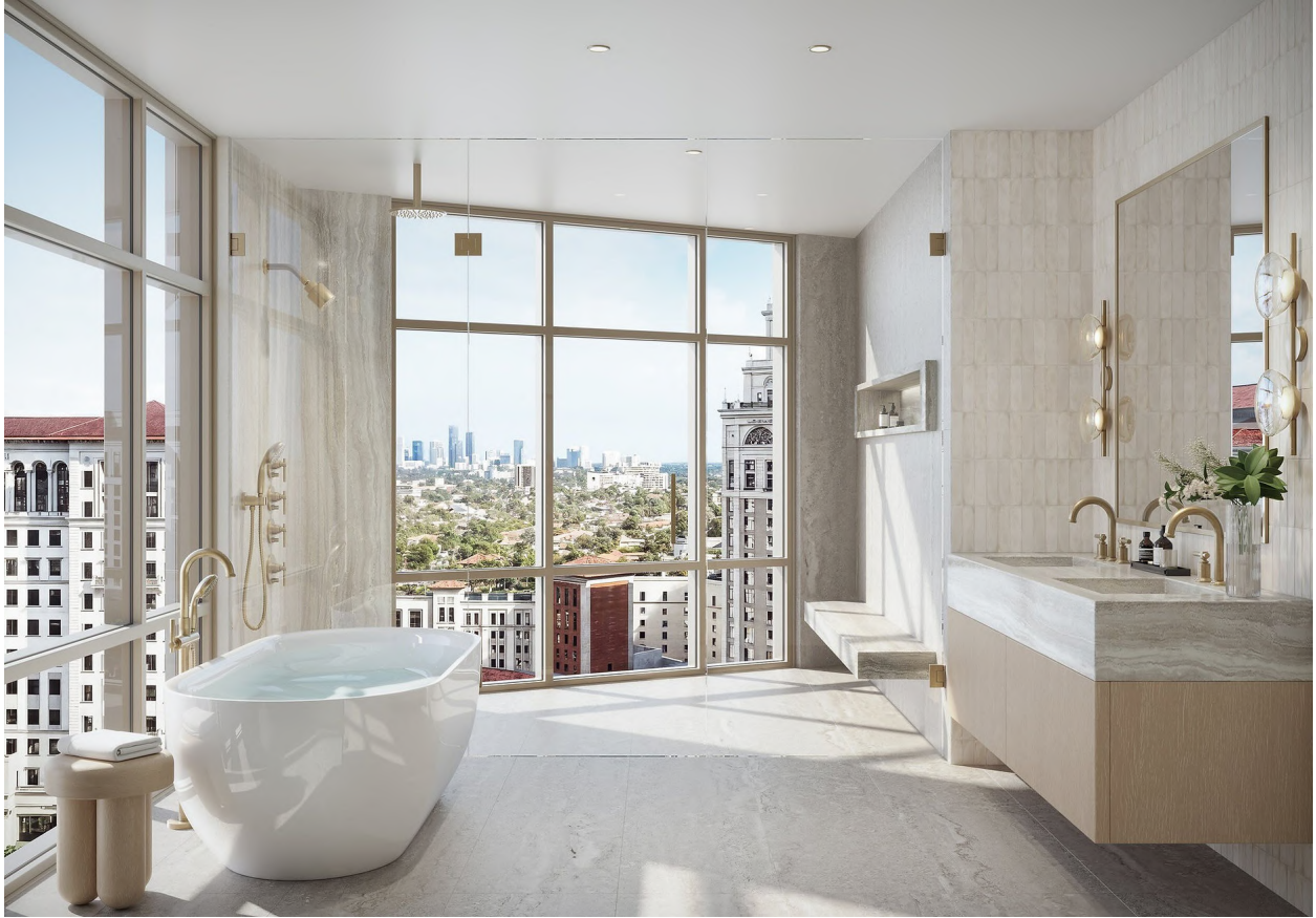
Ponce Park