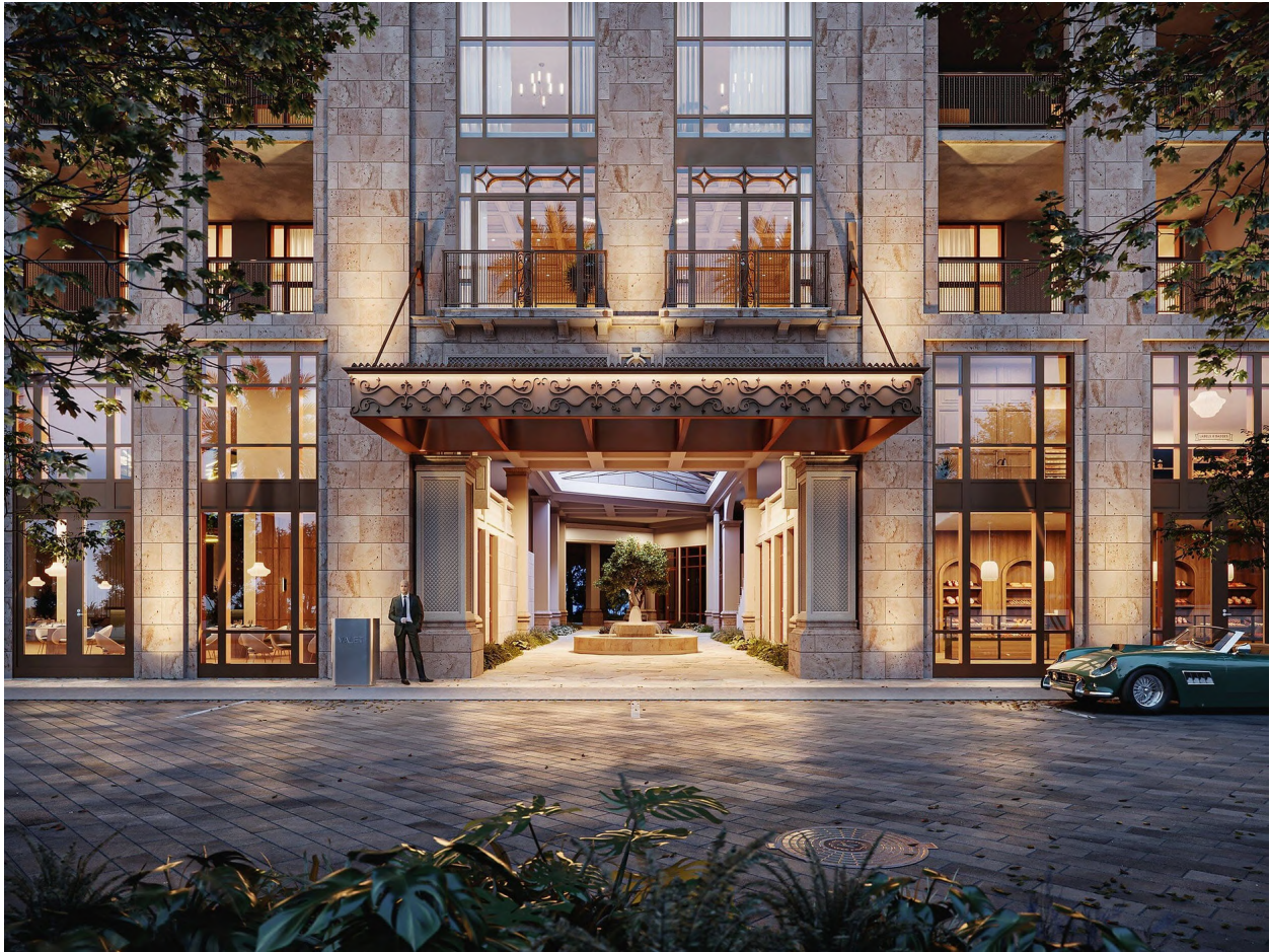
Ponce Park, Courtesy of The Allen Morris Company

approach mirrors the Mediterranean Revival character that defines both the neighborhood and the architecture of the project itself.