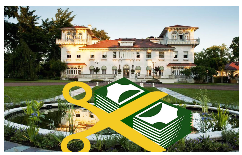
Gloria Crest in Englewood

A northern New Jersey mansion — which has struggled to find a buyer for years — is on the market again, asking nearly 75 percent less than last time.