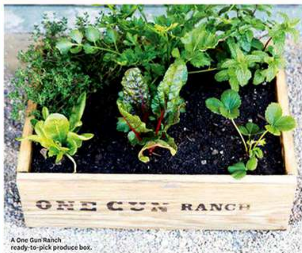
A One Gun Ranch ready-to-pick produce box.