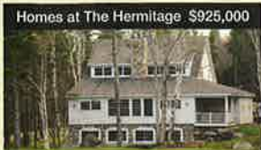
5 BR / 5.5 Baths | 3,687 Sq. Ft. | 3.76 Acres