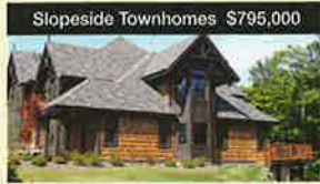
4 BR / 4 Baths | 3,398 Sq. Ft.