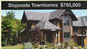
4 BR / 4 Baths | 3,398 Sq. Ft.