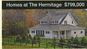
4 BR / 4.5 Baths | 3,570 Sq. Ft. | 1.63 Acres