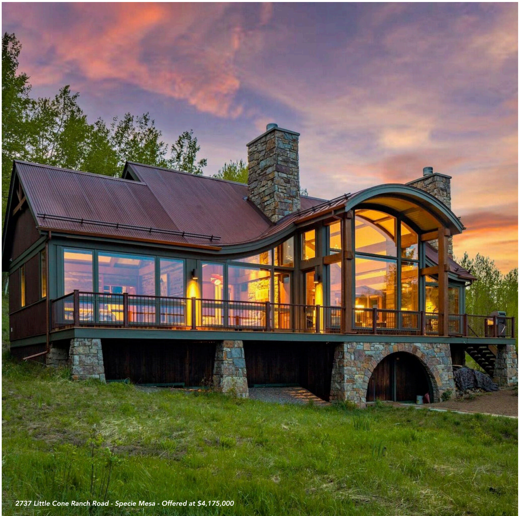
2737 Little Cone Ranch Road - Specie Mesa - Offered at $4,175,000