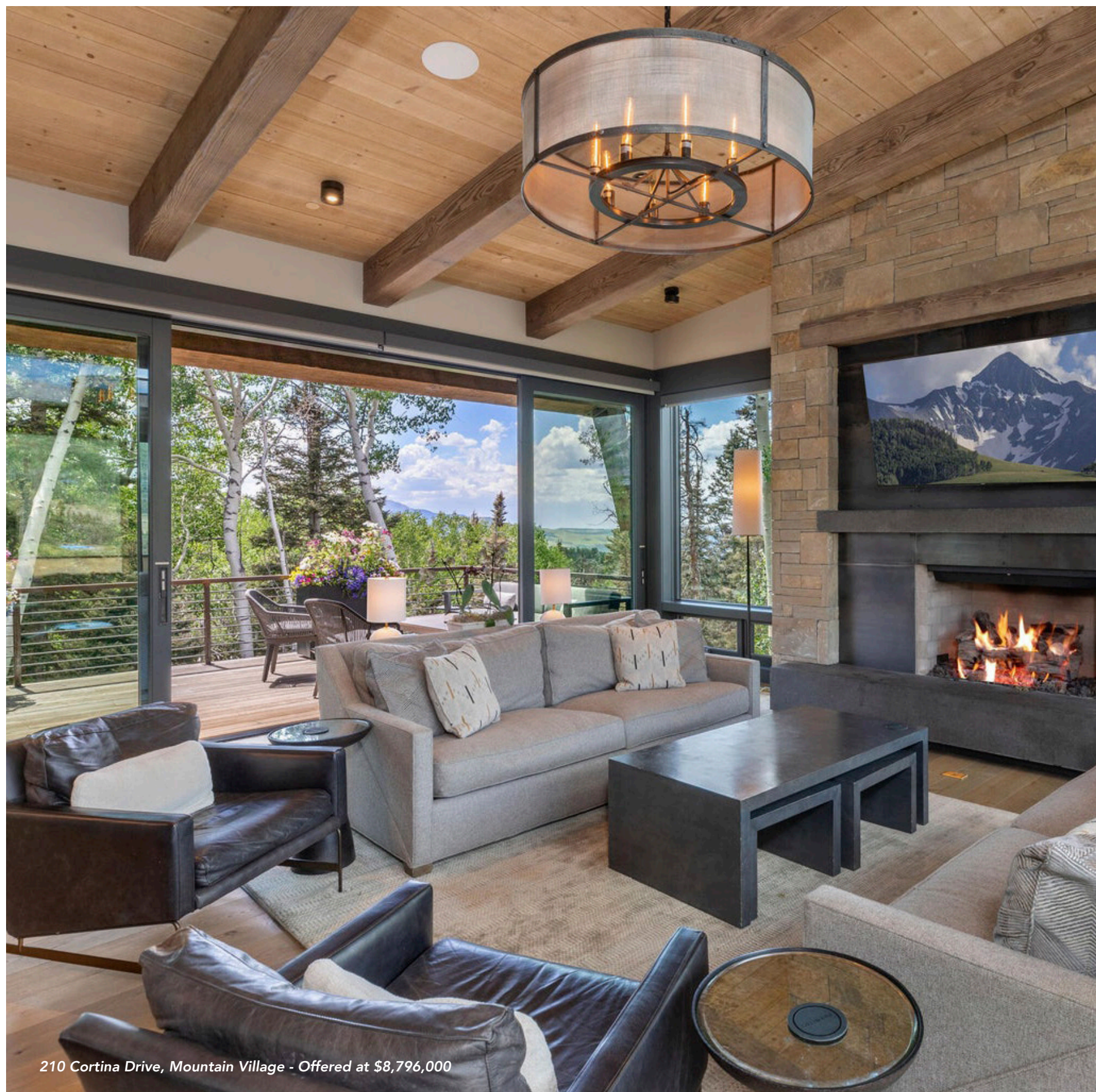
210 Cortina Drive, Mountain Village - Offered at $8,796,000