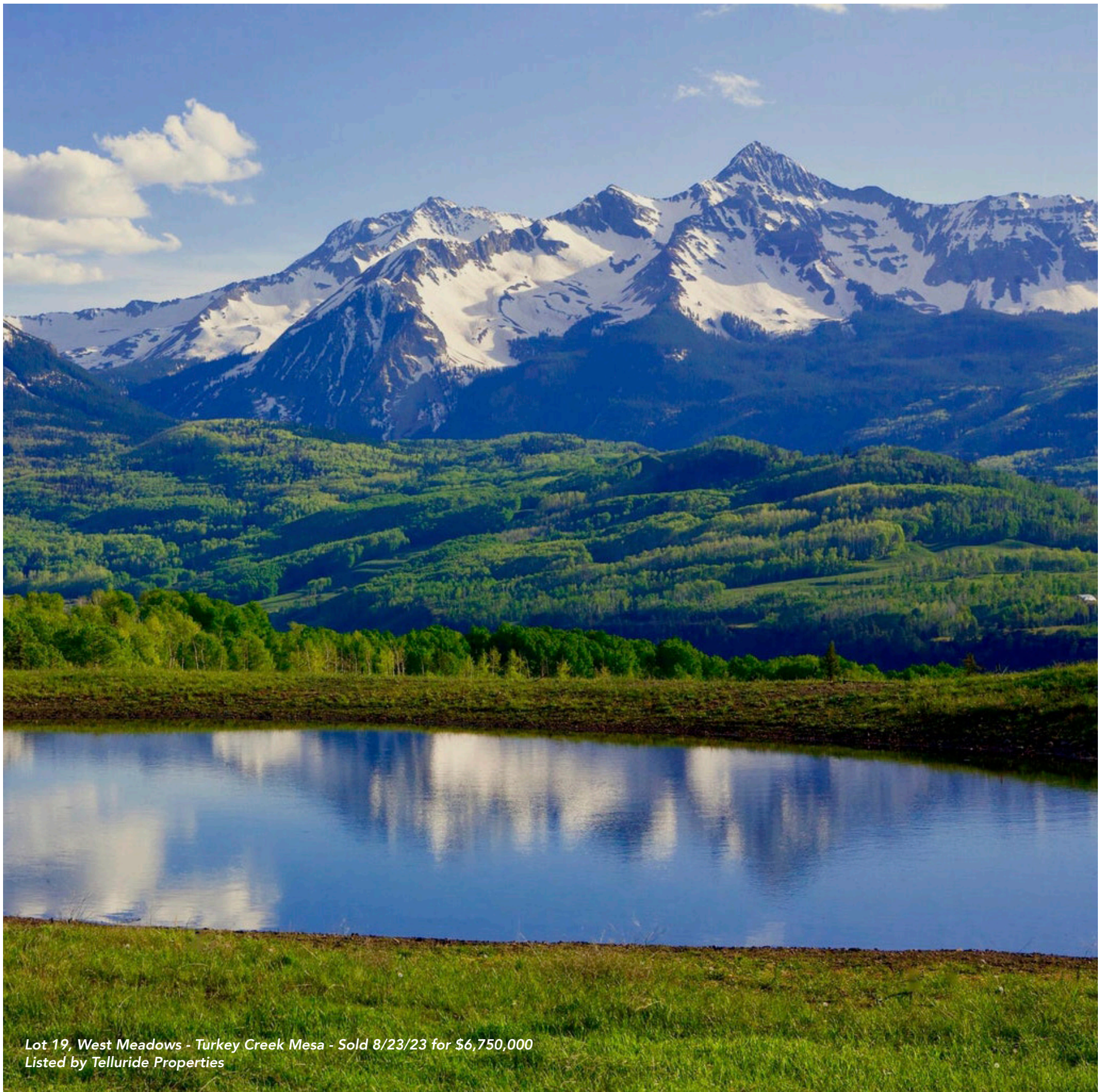
Lot 19, West Meadows - Turkey Creek Mesa - Sold 8/23/23 for $6,750,000 Listed by Telluride Properties