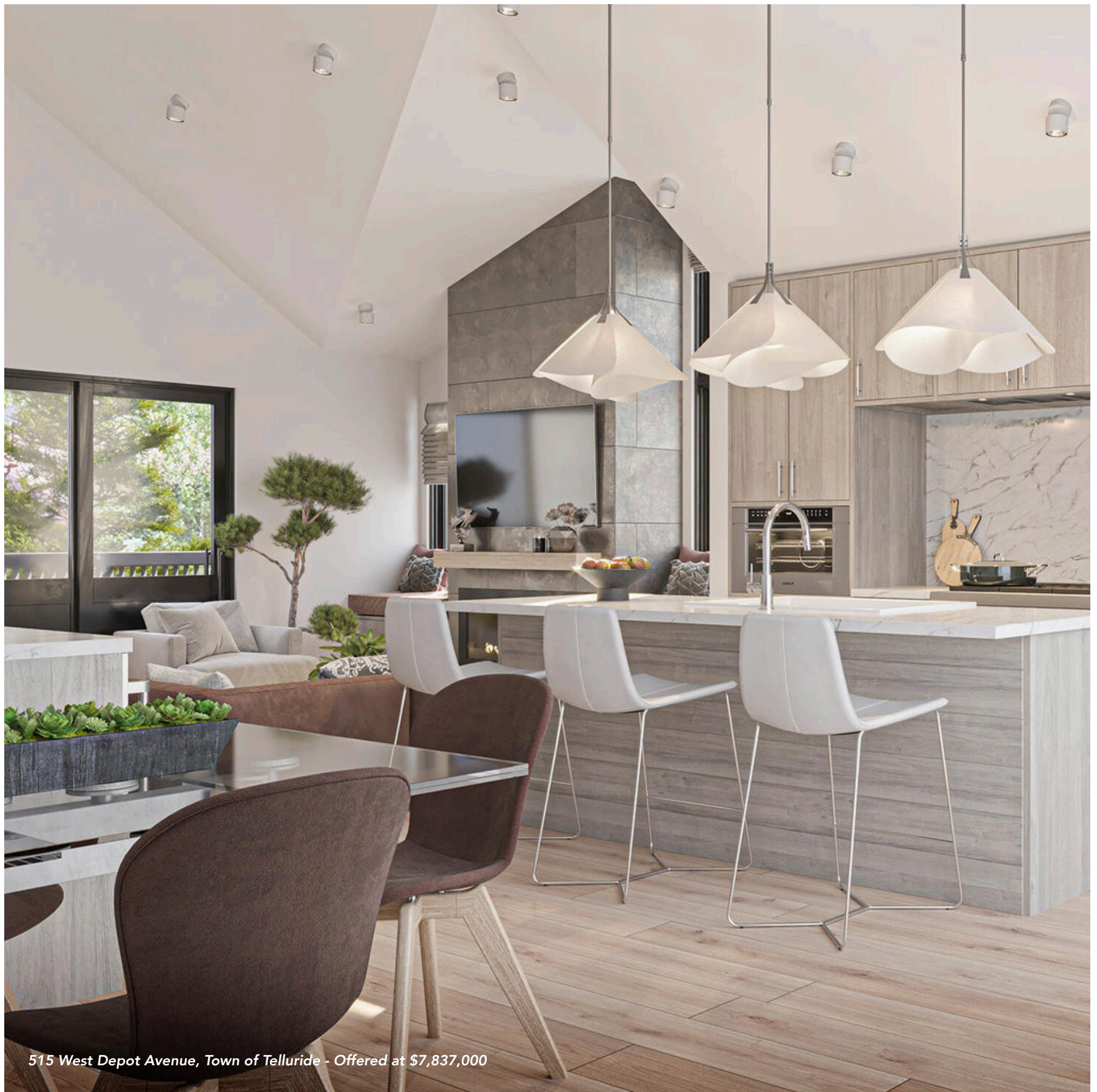
515 West Depot Avenue, Town of Telluride - Offered at $7,837,000