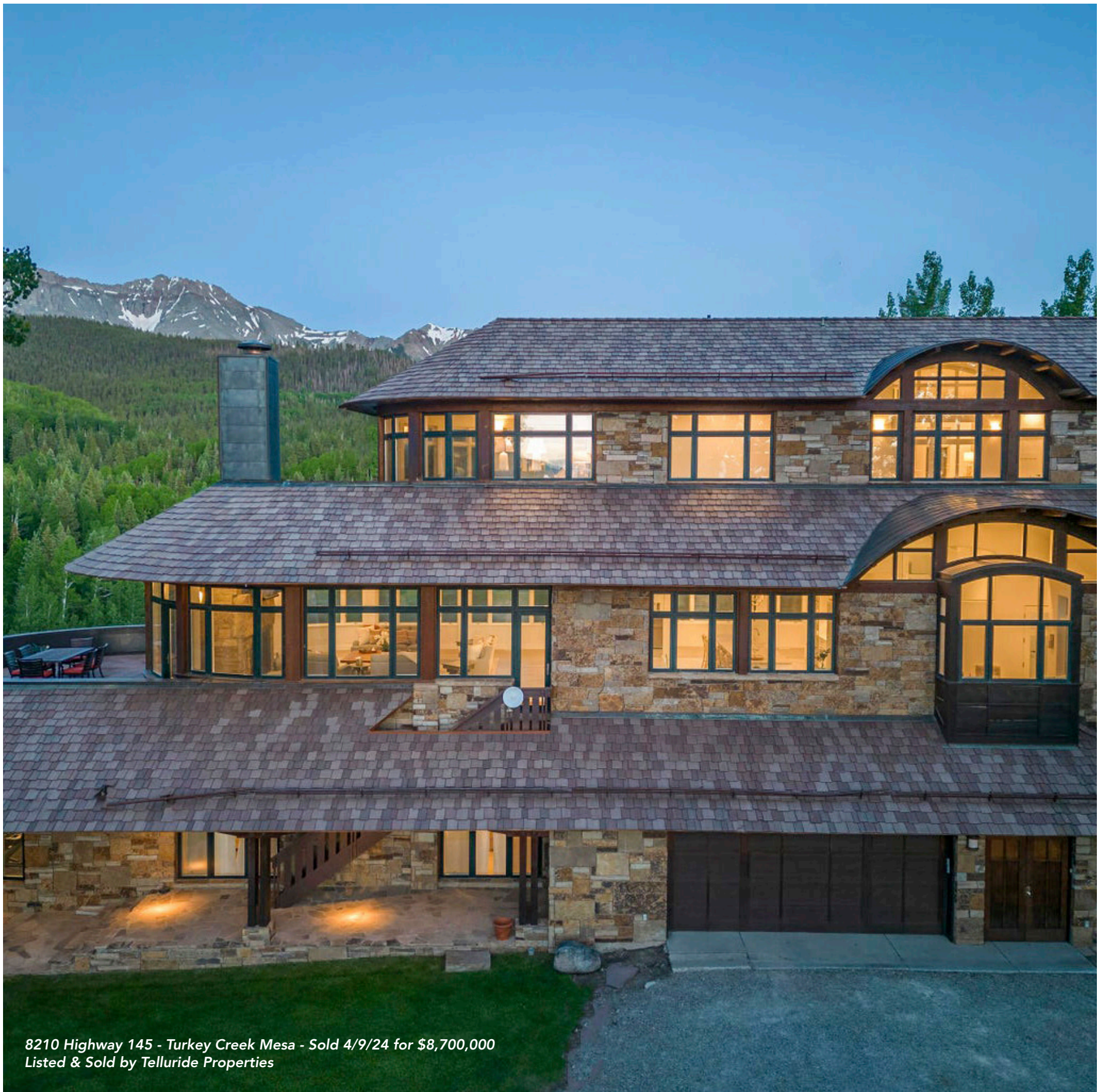
8210 Highway 145 - Turkey Creek Mesa - Sold 4/9/24 for $8,700,000 Listed & Sold by Telluride Properties