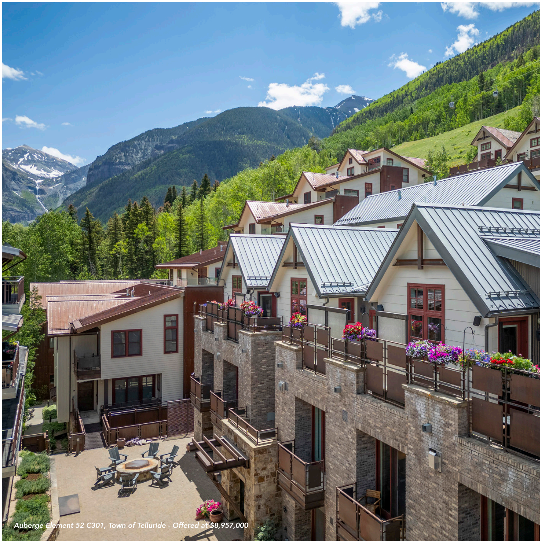
Auberge Element 52 C301, Town of Telluride - Offered at $8,957,000