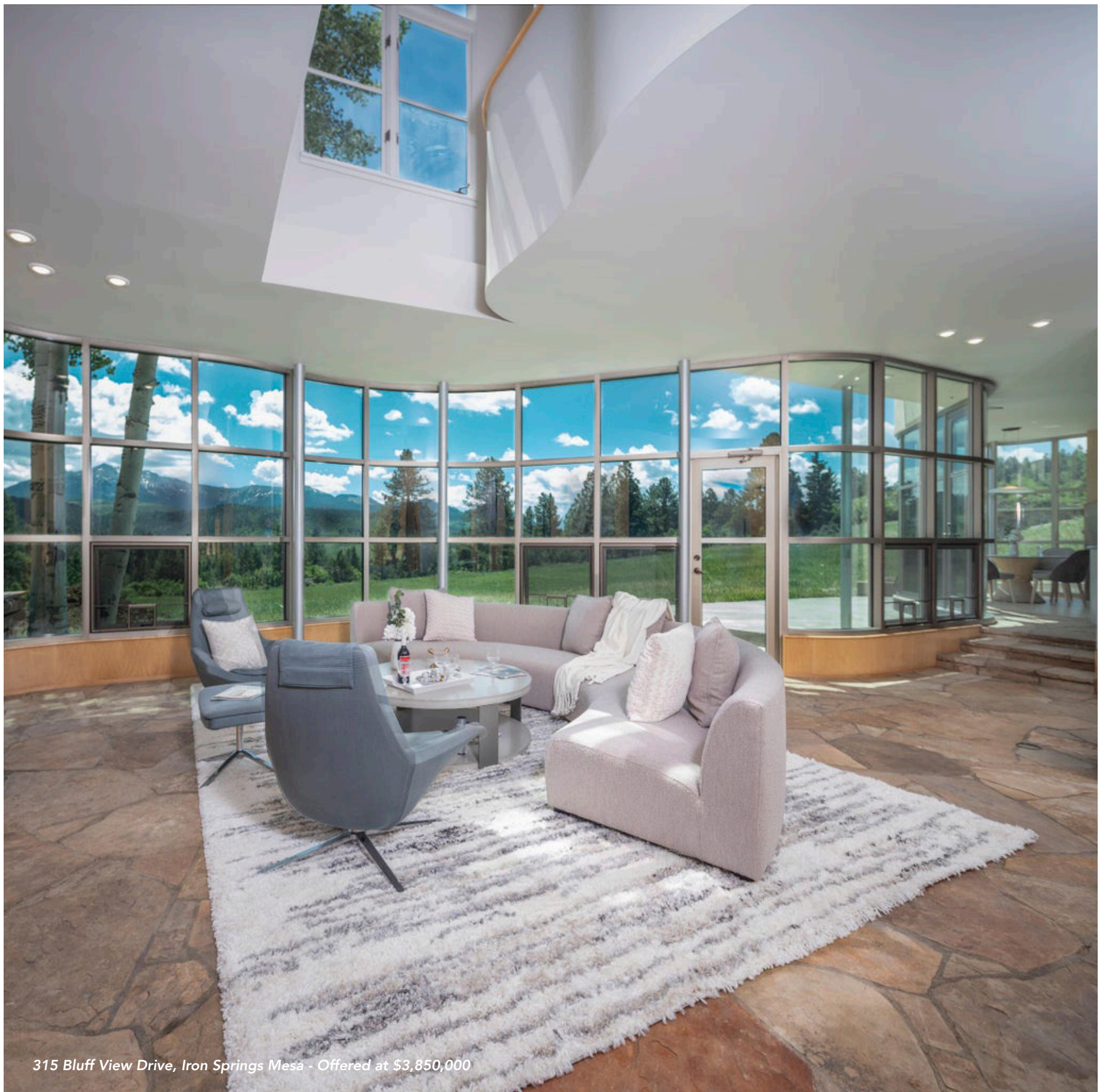
315 Bluff View Drive, Iron Springs Mesa - Offered at $3,850,000