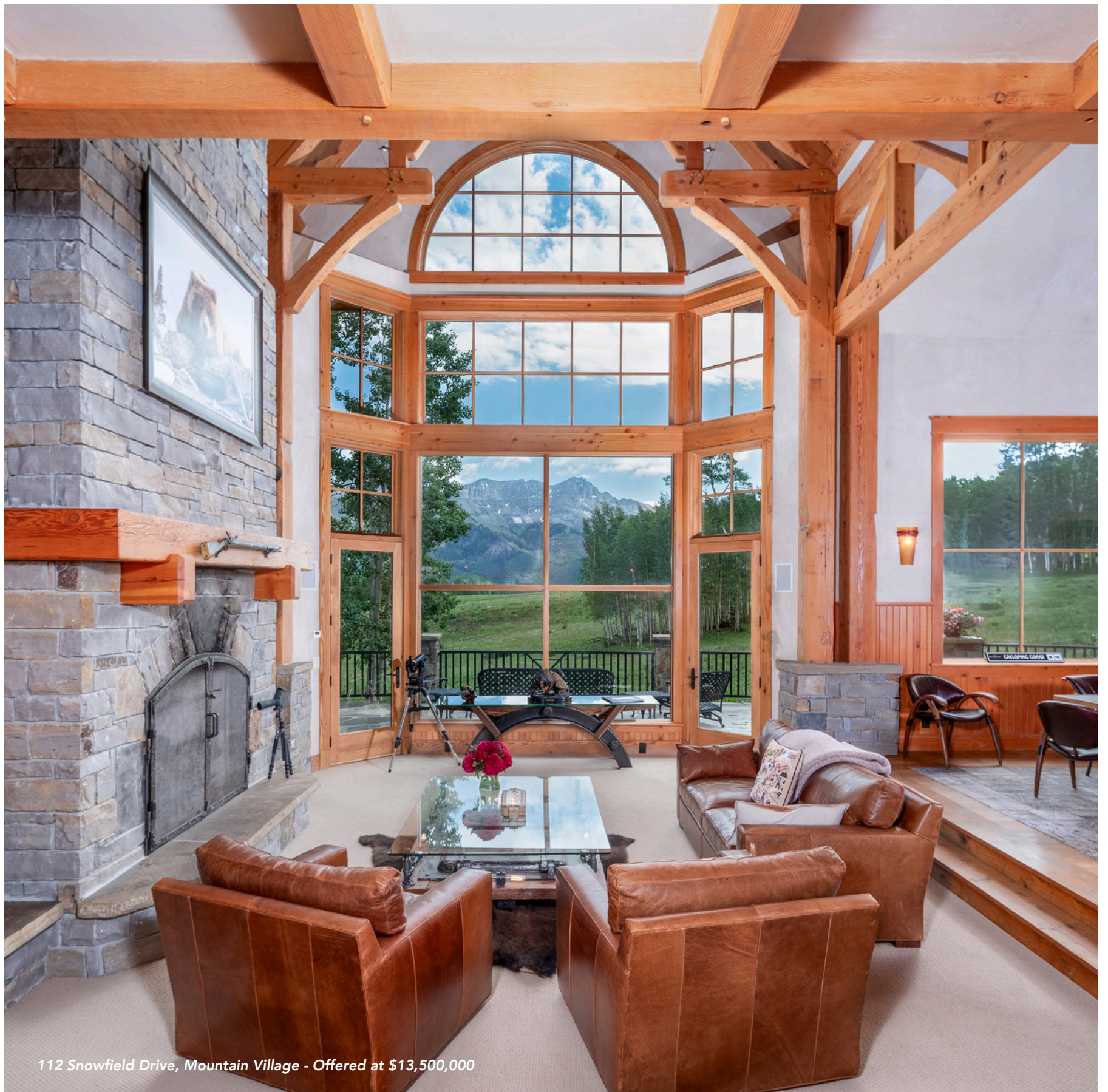
112 Snowfield Drive, Mountain Village - Offered at $13,500,000