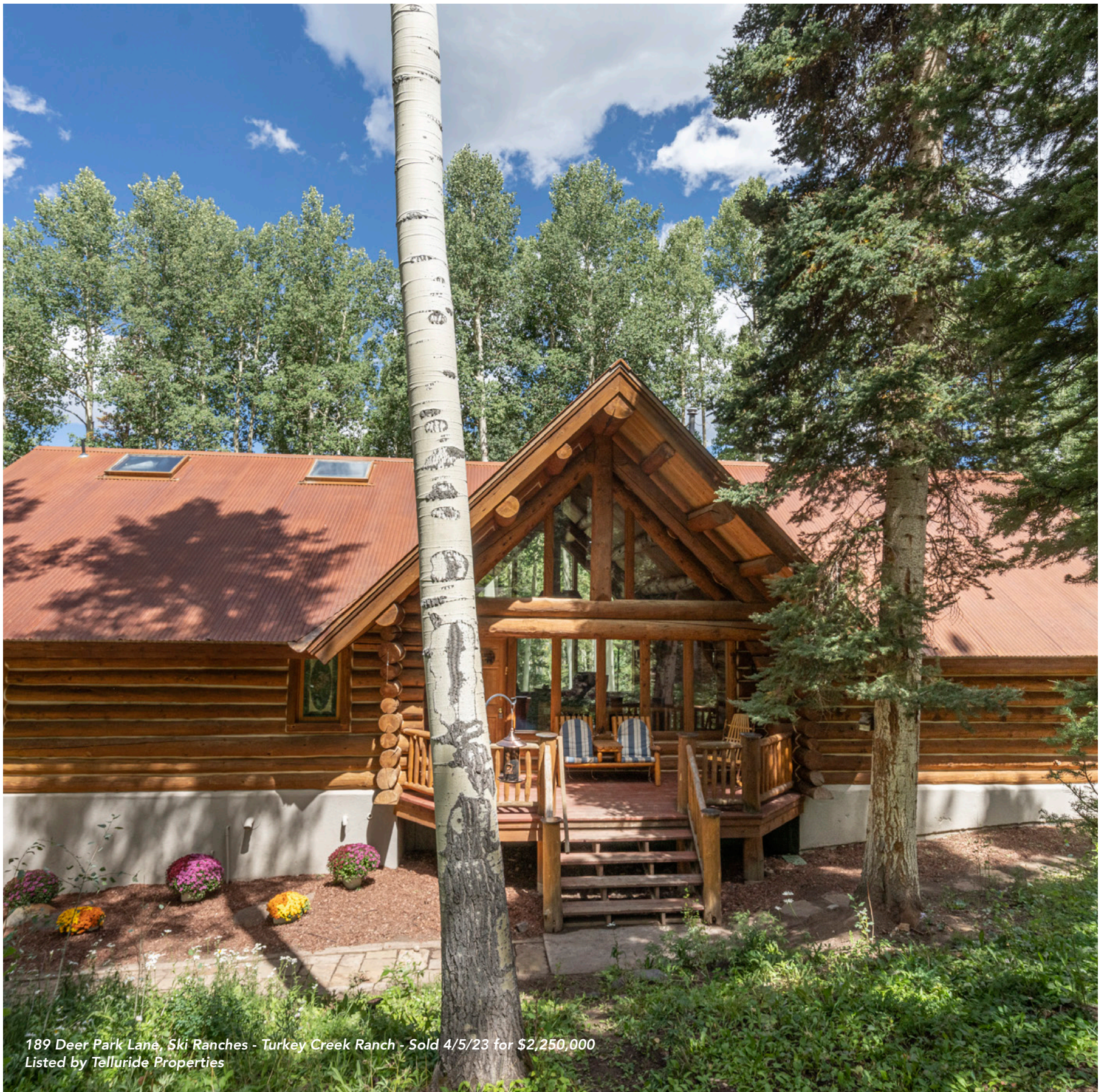
189 Deer Park Lane, Ski Ranches - Turkey Creek Ranch - Sold 4/5/23 for $2,250,000 Listed by Telluride Properties