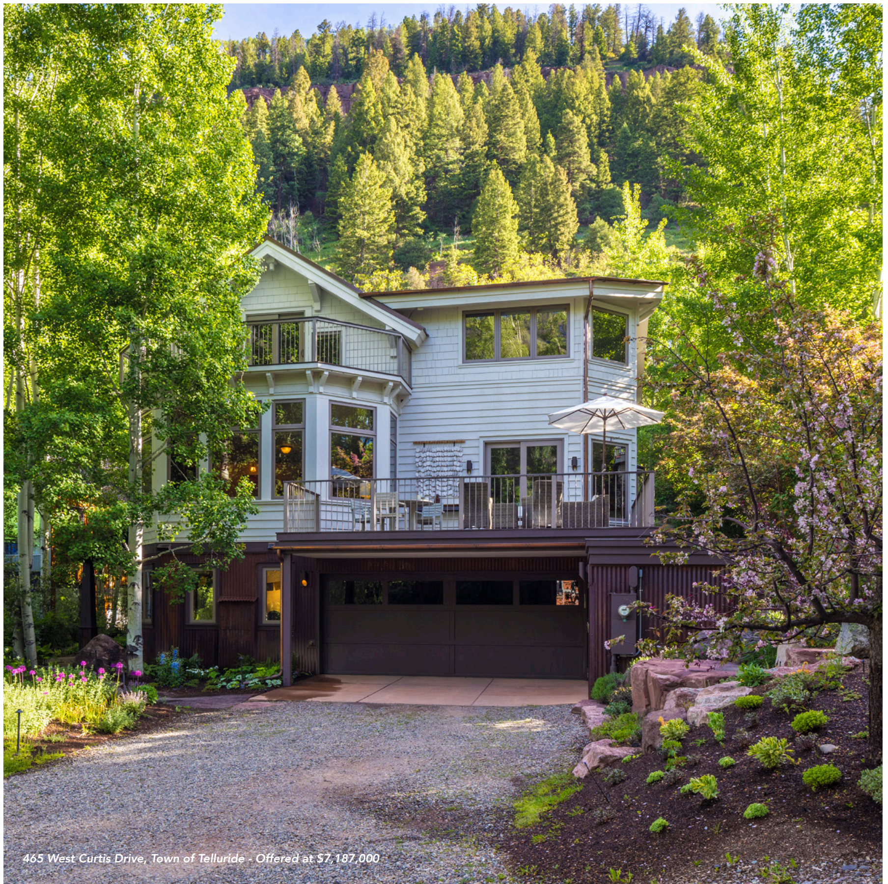
465 West Curtis Drive, Town of Telluride - Offered at $7,187,000