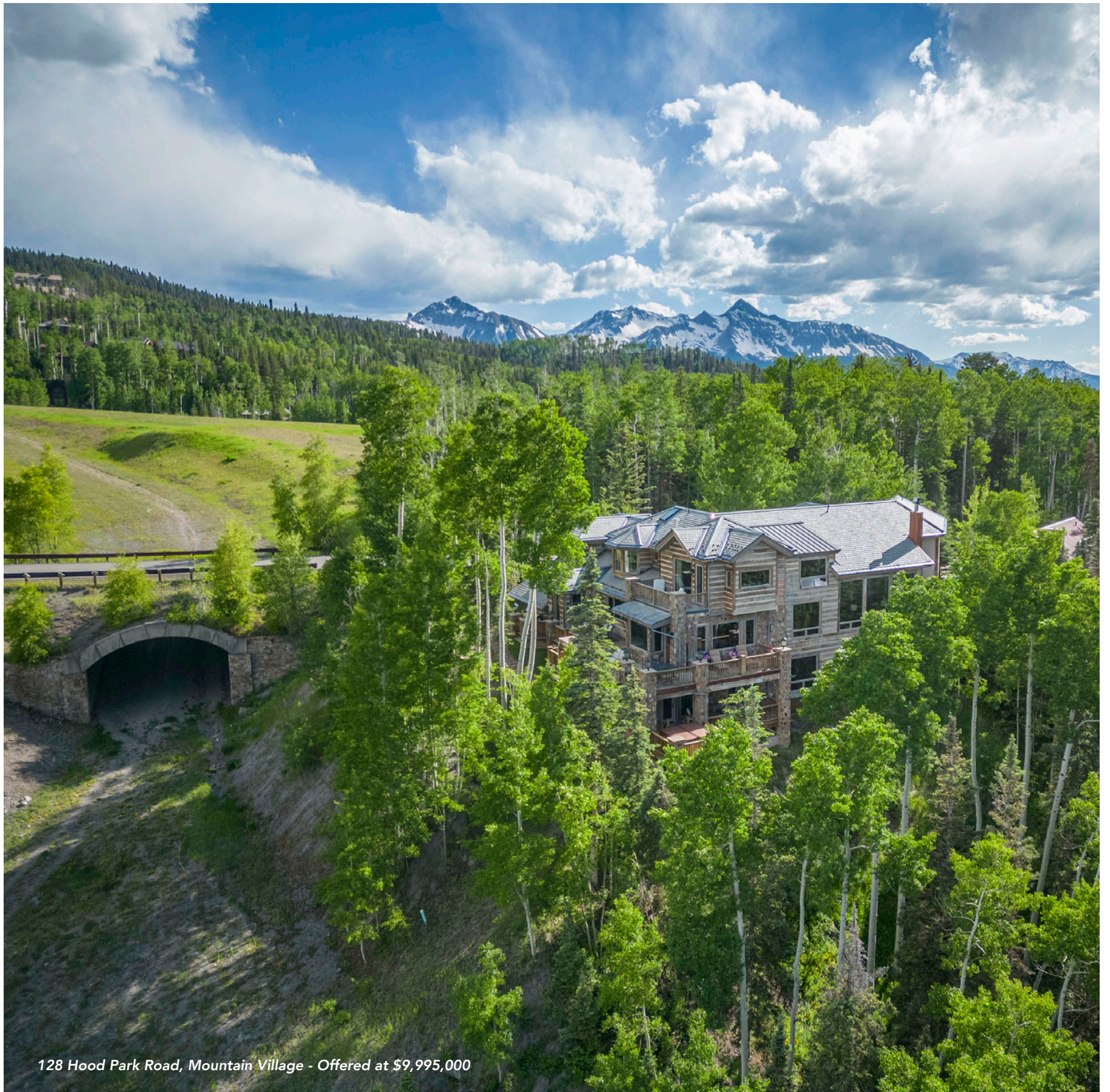
128 Hood Park Road, Mountain Village - Offered at $9,995,000