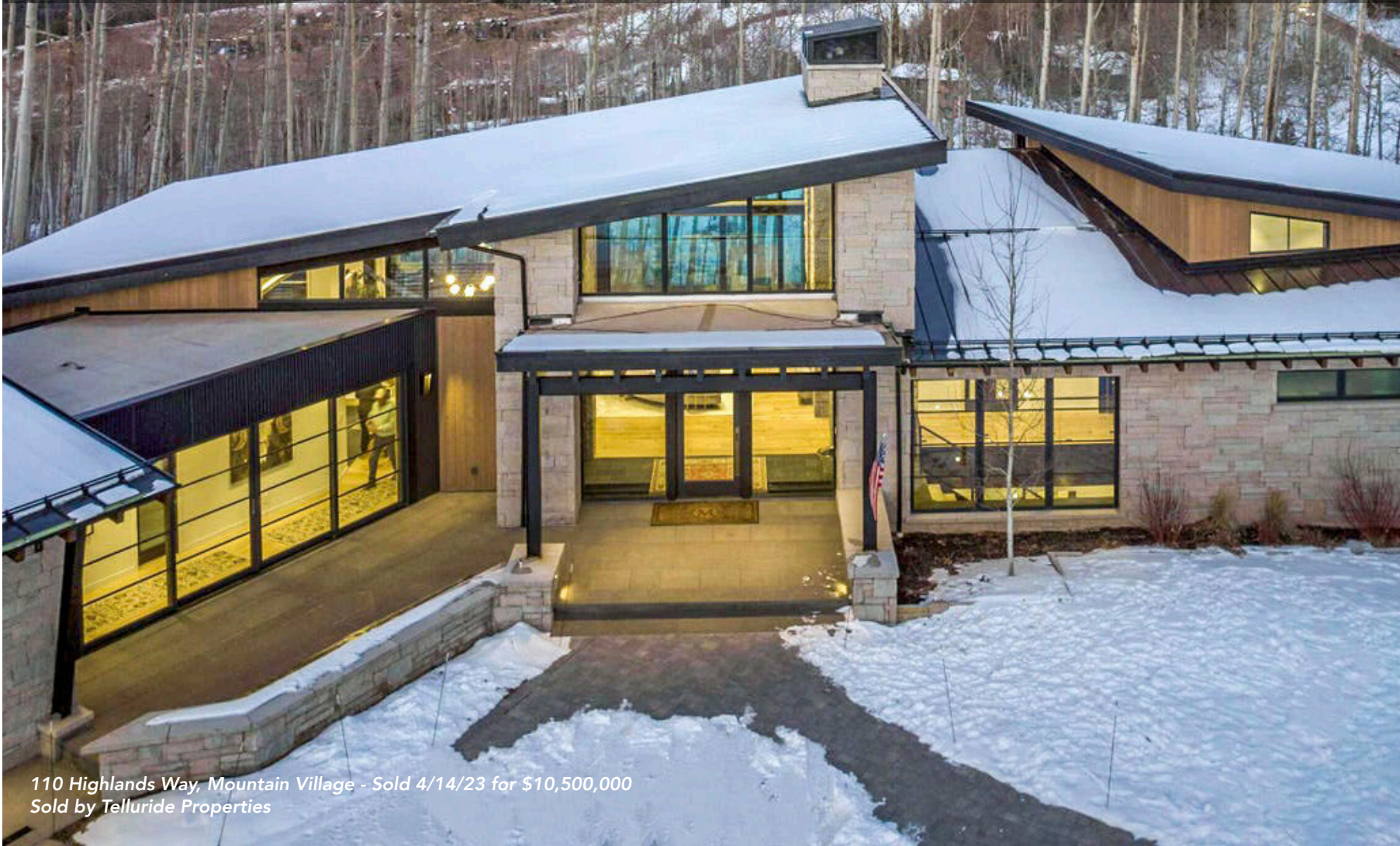
110 Highlands Way, Mountain Village - Sold 4/14/23 for $10,500,000 Sold by Telluride Properties