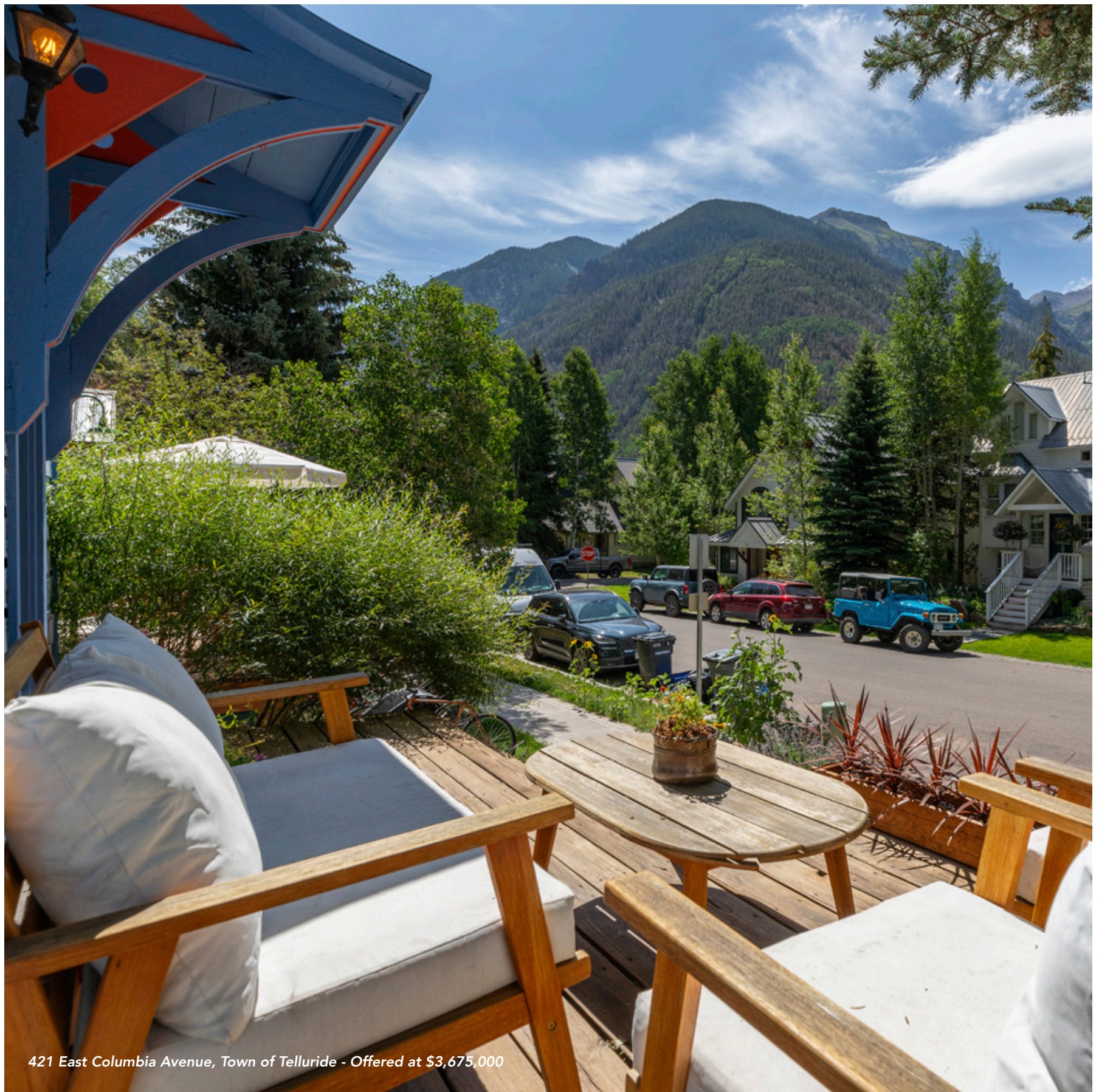
421 East Columbia Avenue, Town of Telluride - Offered at $3,675,000