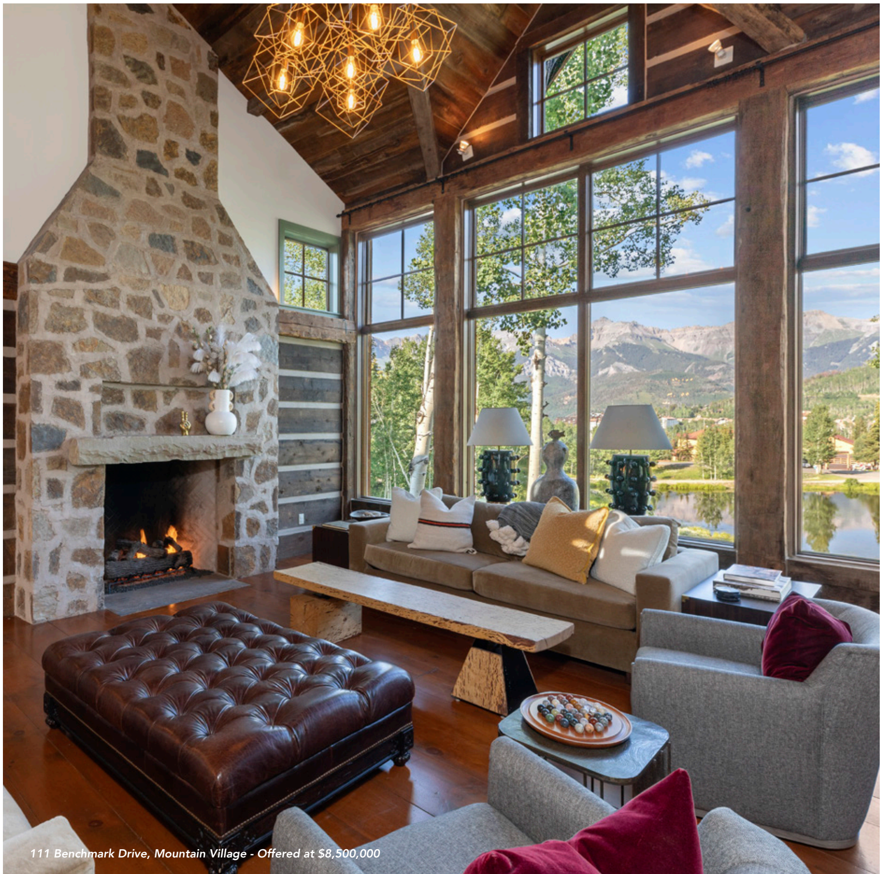
111 Benchmark Drive, Mountain Village - Offered at $8,500,000