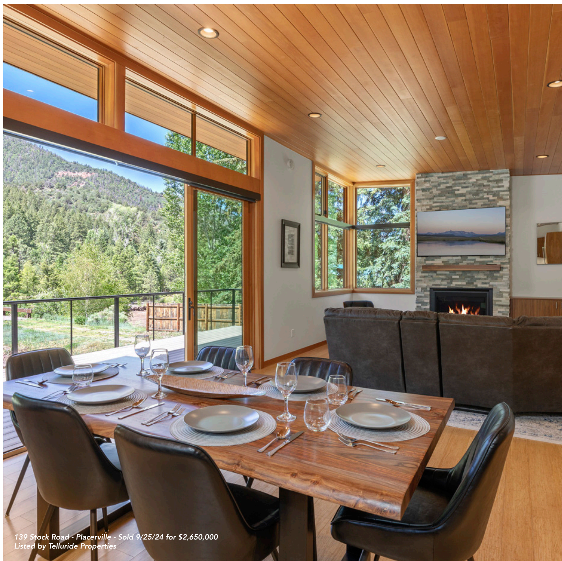
139 Stock Road - Placerville - Sold 9/25/24 for $2,650,000 Listed by Telluride Properties