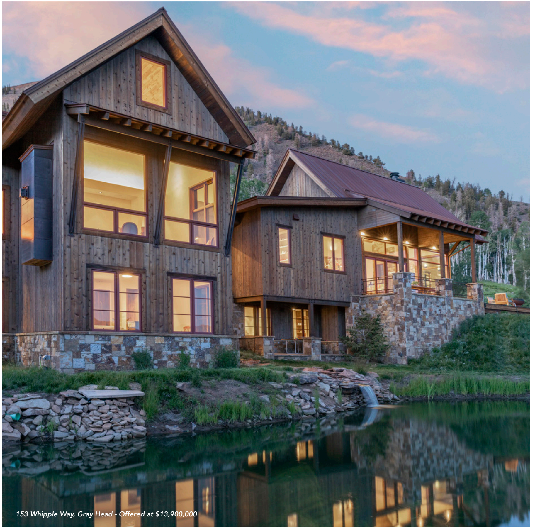
153 Whipple Way, Gray Head - Offered at $13,900,000