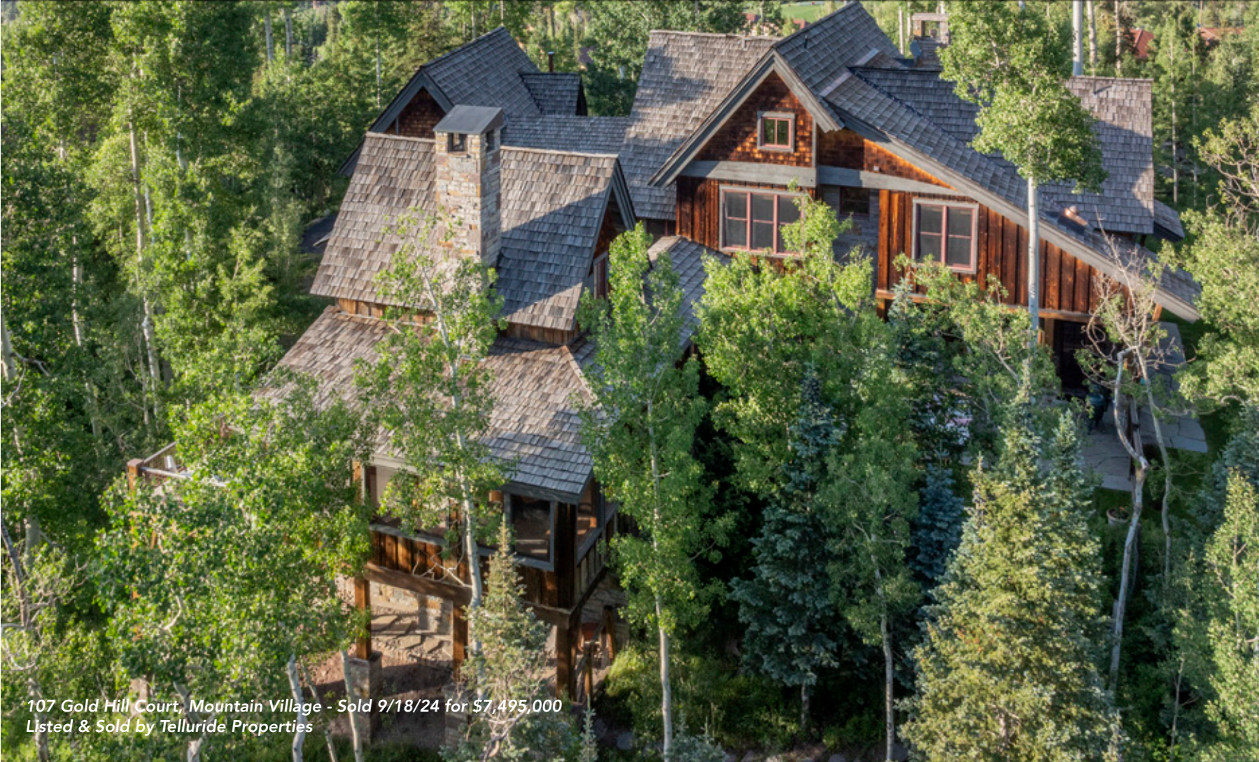
107 Gold Hill Court, Mountain Village - Sold 9/18/24 for $7,495,000 Listed & Sold by Telluride Properties