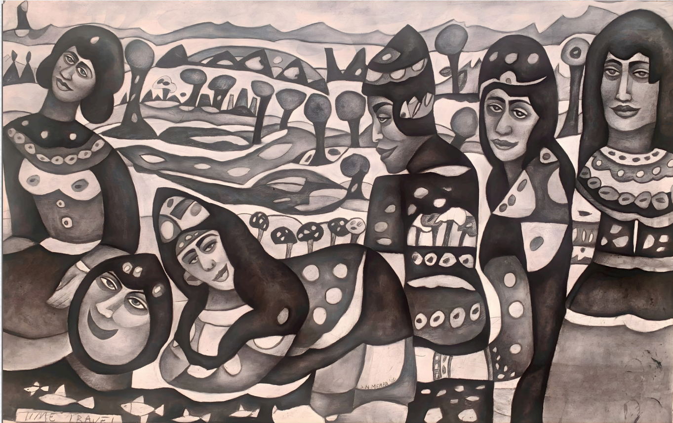
TIME TRAVEL | CHARCOAL ON PAPER | 42 inch x 65.5 inch | 2020

A painting capturing the ethereal moment of stepping through the stones, blending the rugged Scottish Highlands with the shimmering veil of time. It explores the enduring pull of history and love across centuries.