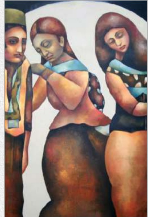
ANTICIPATION | OIL ON CANVAS | 20 inch x 32 inch (EACH PANEL) | 2010

We, humans, are inquisitive souls - always yearning to know how will our future unfold. Spiralling in depths of anticipation, which, for most times, is far worse than our beautiful reality.