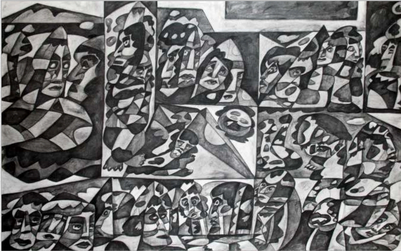
PEARLY GATES | CHARCOAL ON PAPER | 58 inch x 96 inch | 2016

Life is a journey between earth to heaven. Till we live as humans, we are always either unhappy or sad or constantly desiring for more - forgetting that happiness is nothing but a state of being, and these 'Pearly Gates' are a metaphor of the same.