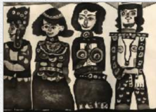
BALI SERIES | CHARCOAL ON PAPER | 48 inch x 60 inch (EACH PANEL) | 2019

This artwork is inspired by the feeling of surreality and amazement that I experienced at the beautiful temples in Bali. A second glance at them - took me back to the time they were created, and I transpired that vision onto the paper.