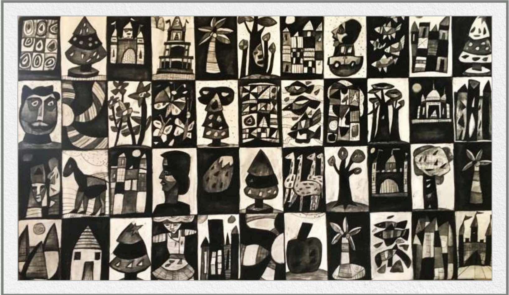
THINGS I TEACH @ ART WONDER | CHARCOAL ON PAPER | 58 inch x 96 inch | 2017

Inspired by the child-like quality in Paul Klees' work- a drawing is a line going for a walk. One of my first charcoal works at CSM London, this work is also a representation of my teaching approach at Art Wonder.