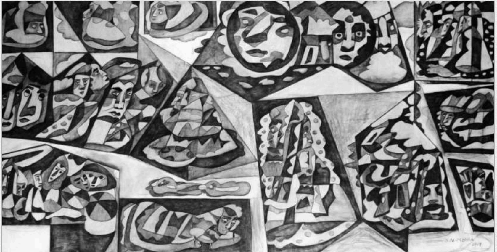
DESTINED CAGE | CHARCOAL ON PAPER | 48 inch x 96 inch | 2009

Destiny is better defined as one's life purpose decided by a higher power. But, what if - that very destiny begins to feel like a jinx, a series of misfortunes, and, suddenly, you are caged in your own being!