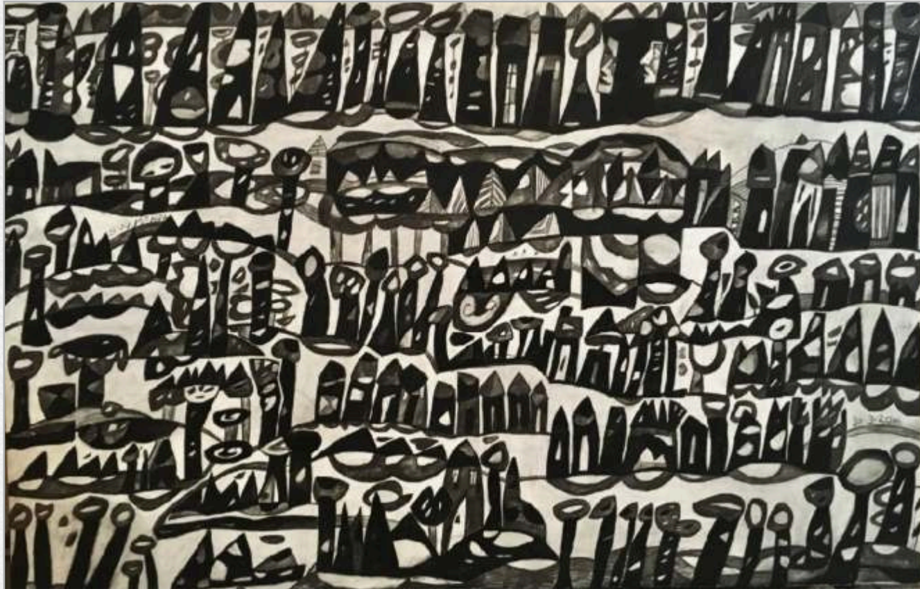
COSMOS | CHARCOAL ON PAPER | 72 inch x 48 inch | 2016

Adam and Eve, according to the creation myth of the Abrahamic religions, were the first man and woman. Their love story always begins with a question and is filled with theories and analogies, further interpreted in this artwork.