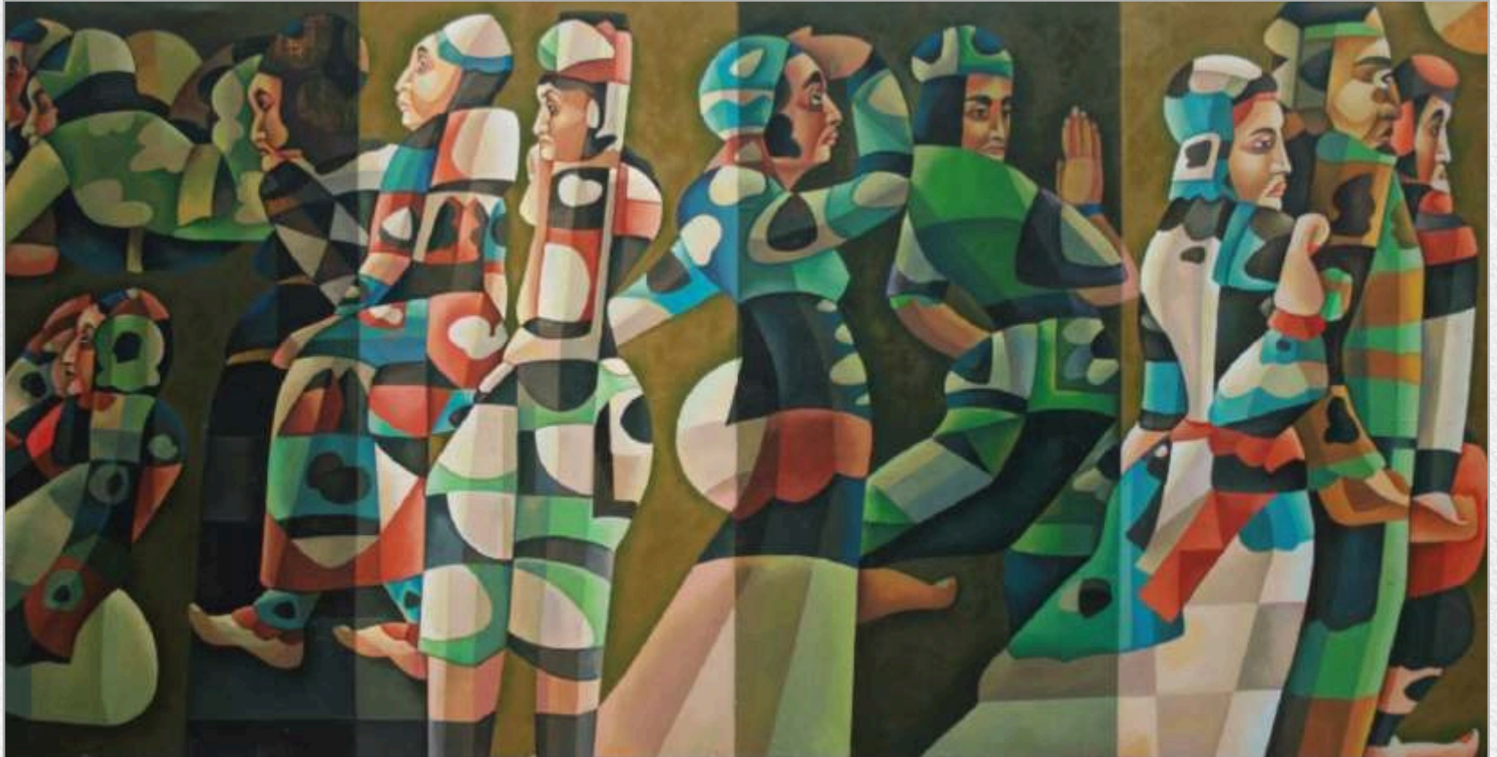
EARTH TO EARTH | OIL ON CANVAS | 48 inch x 96 inch | 2013

Have you ever experienced existential questions after a personal loss? Like, who are we? Where do we come from? Where do we go? Ashes to ashes, earth to earth, life is just a journey between heaven and earth.