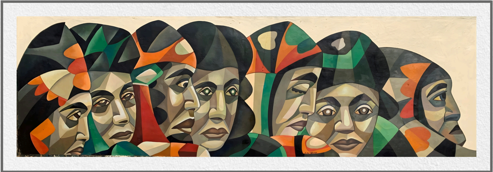
FACES | OIL ON CANVAS | 20 inch x 71 inch | 2015

A collection of expressive faces on canvas, each telling a silent story and reflecting the many layers of human identity.