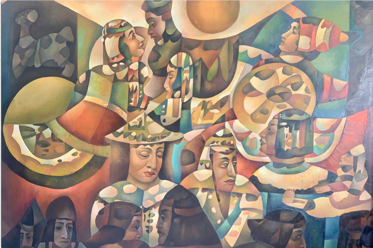
FATE & FORTUNE | OIL ON CANVAS | 72 inch x 96 inch | 2014

This piece explores the porous boundary between what we envision and what we inhabit. It captures the moment where the ethereal nature of dreams collides with the weight of reality, suggesting that our lived experience is a constant synthesis of both