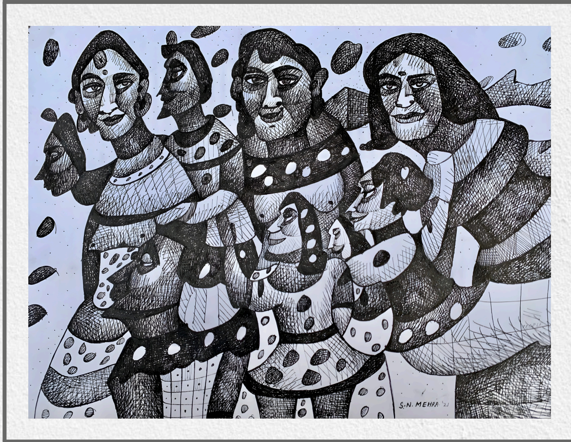
PEOPLE | PEN ON PAPER | 16 INCH X 11.5 INCH | 2021

This drawing reflects the emotional and physical interconnectivity between people, revealing the unseen bonds formed through shared presence, touch, and feeling. create a quiet constant exchange