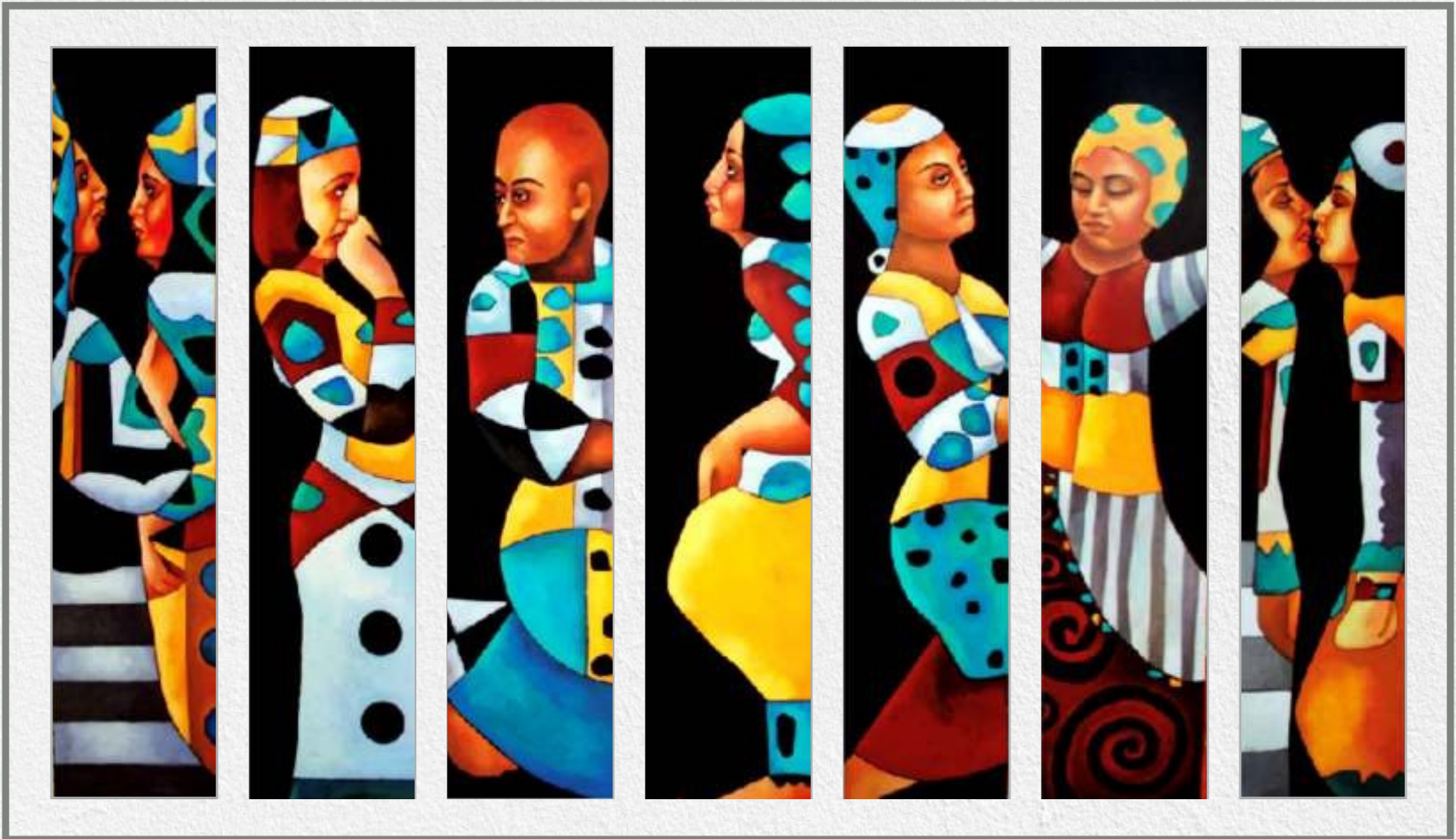
BLISS | OIL ON CANVAS | 48 inch x 12 inch (EACH PANEL) | 2012

Ignorance is bliss, for a creative mind - how true could this saying be! Imagine, enjoying your own company - away from the happenings of the functioning world, where you are alone with your thoughts and colours.