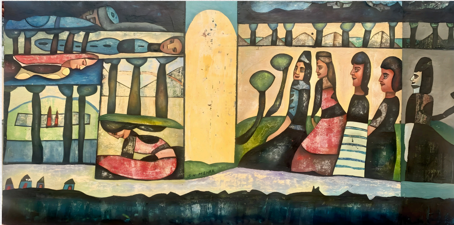
LIFE | OIL ON CANVAS | 36 inch x 72 inch | 2020

A visual dialogue exploring how sorrow and joy intertwine, shaping one another to define the depth, contrast, and richness of human existence.