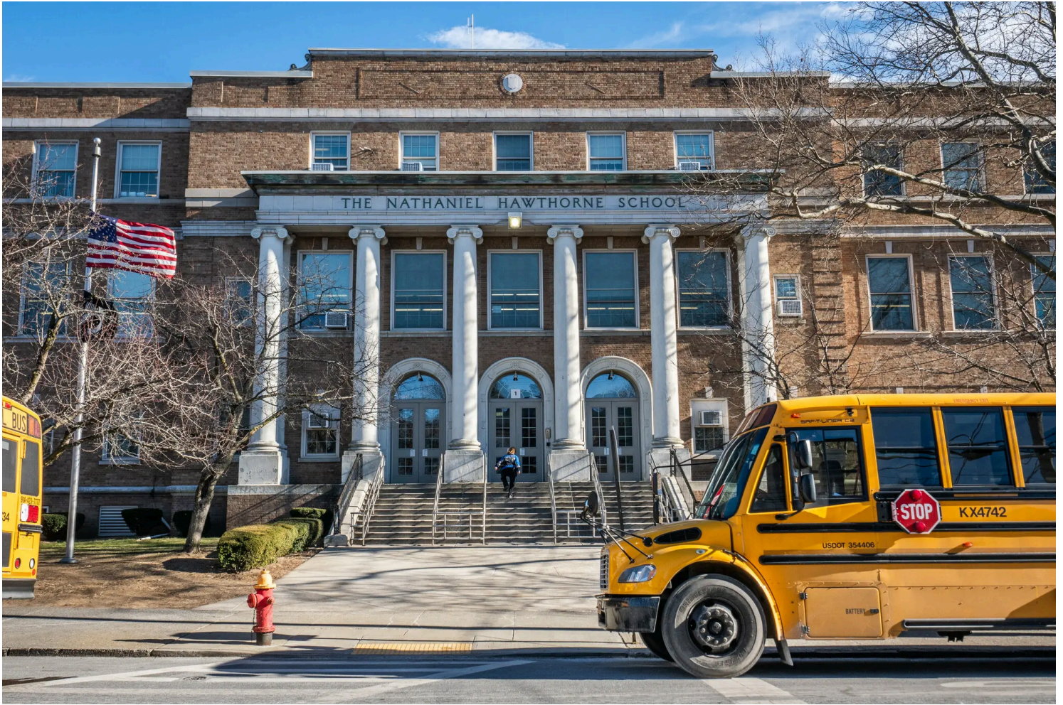
PEARLS Hawthorne School.