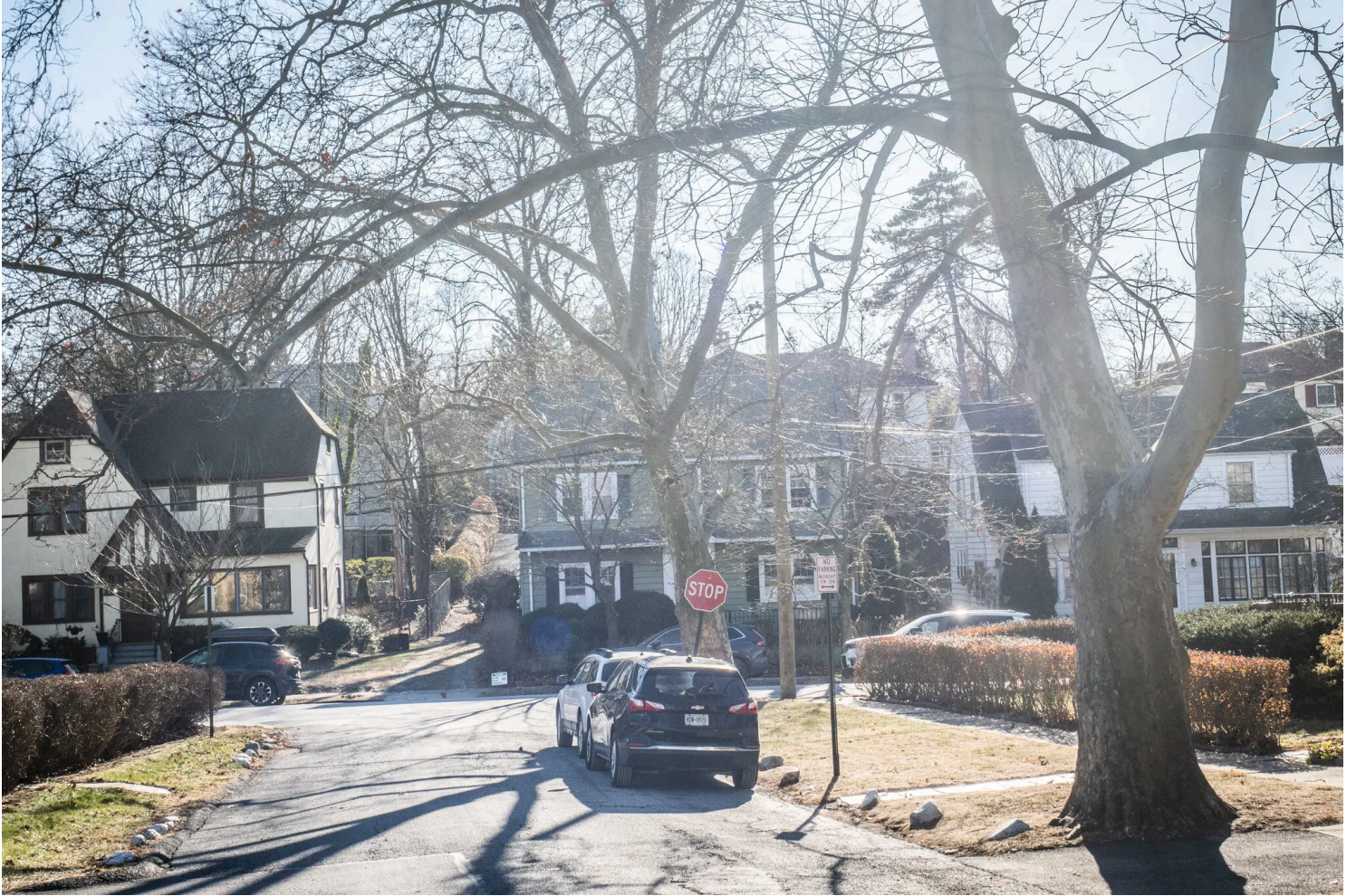
The Ludlow neighborhood

Homes range from single to multifamily, depending on the neighborhood.