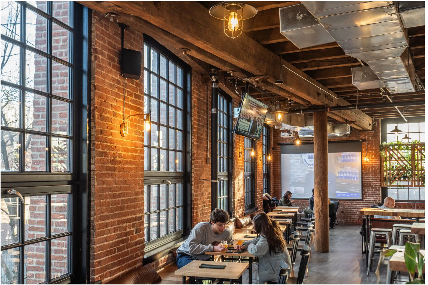
Simple Motive Brewing Company in the Alexander Smith Carpet Mills Historic District in Yonkers.

And as New York City housing costs increase, some residents are choosing Yonkers for its convenience and affordability. The downtown is a 30-minute Metro-North ride on the Hudson Line from Grand Central Terminal. Once there, large residential buildings on the banks of the Hudson River give way to single-family homes in other areas. New high-rises have popped up, with more under construction.