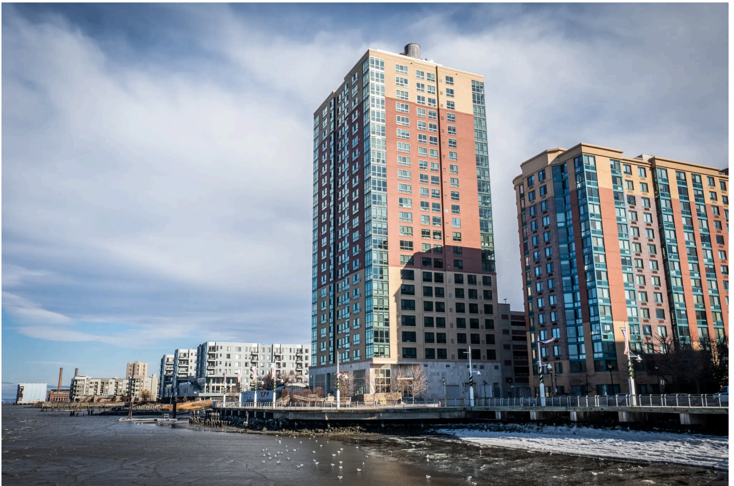
The downtown waterfront.