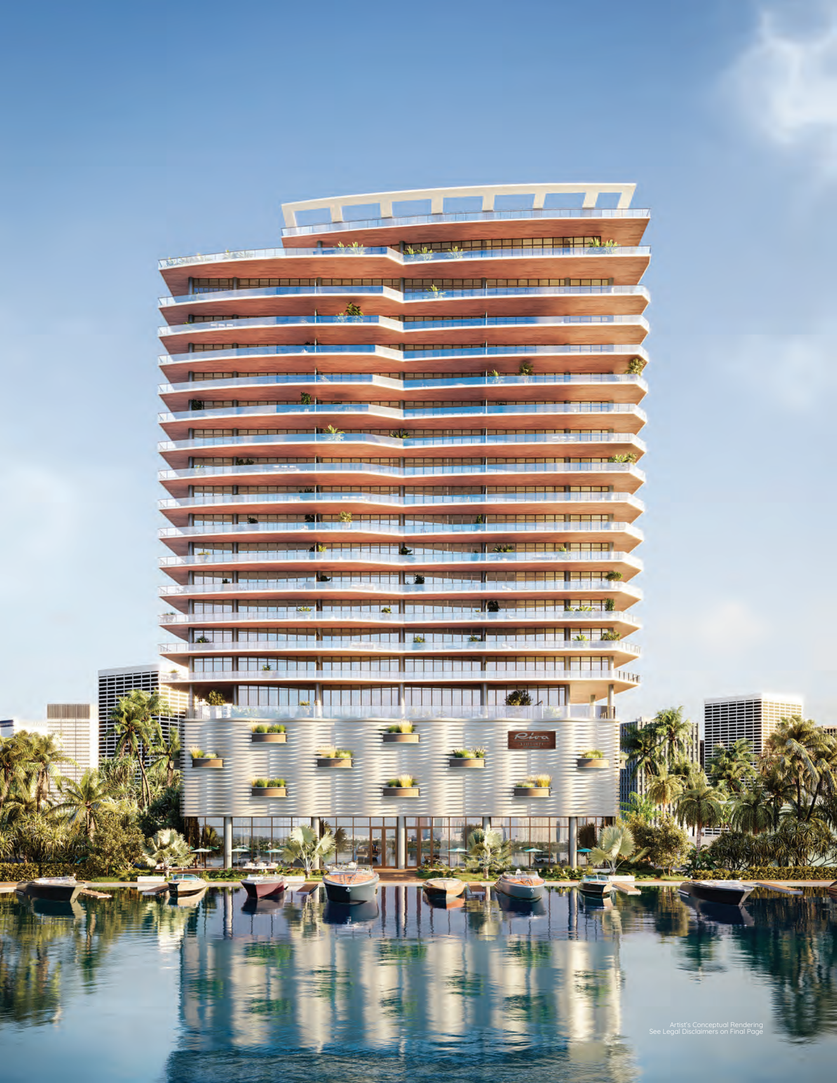
Artist's Conceptual Rendering See Legal Disclaimers on Final Page