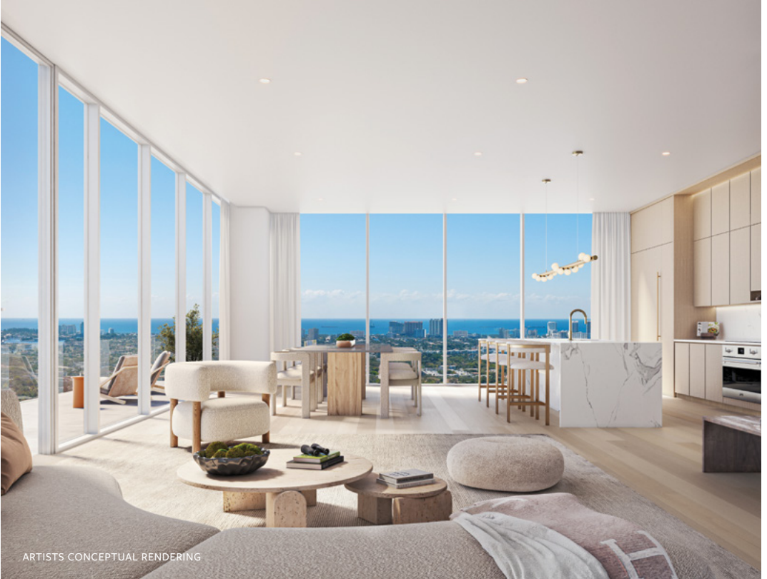
ARTISTS CONCEPTUAL RENDERING

With a community plaza for everyday conveniences and 100,000 SF of limitless amenity space exclusive to residents, Ombelle offers a lifestyle unlike anything yet to be imagined in Fort Lauderdale.