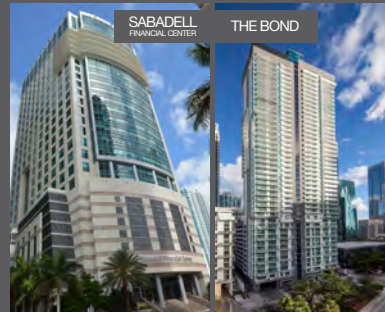
SABADELL FINANCIAL CENTER