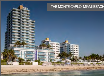
THE MONTE CARLO, MIAMI BEACH