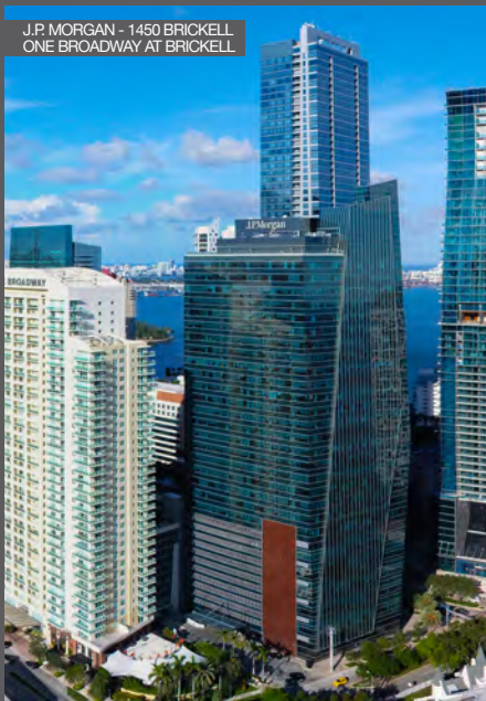
J.P. MORGAN - 1450 BRICKELL ONE BROADWAY AT BRICKELL