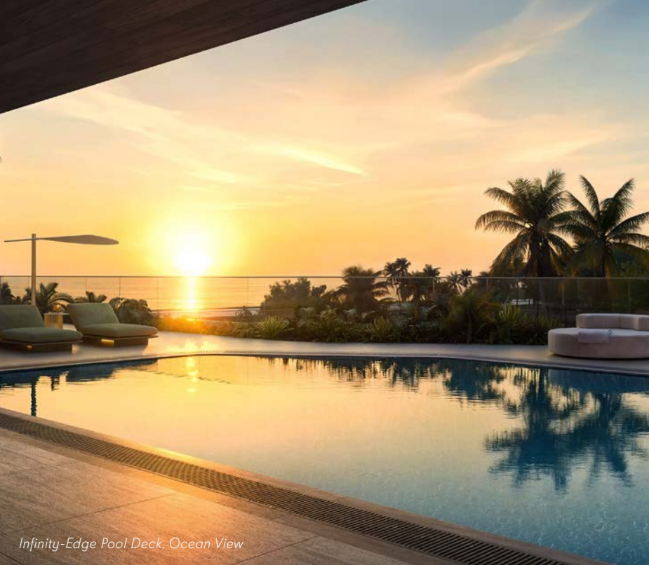
Infinity-Edge Pool Deck, Ocean View