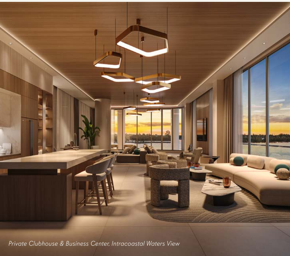
Private Clubhouse & Business Center, Intracoastal Waters View