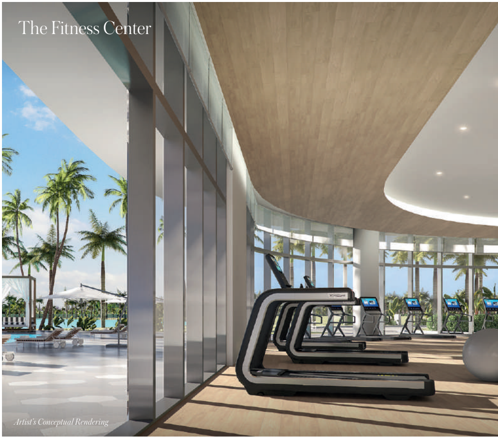
The Fitness Center