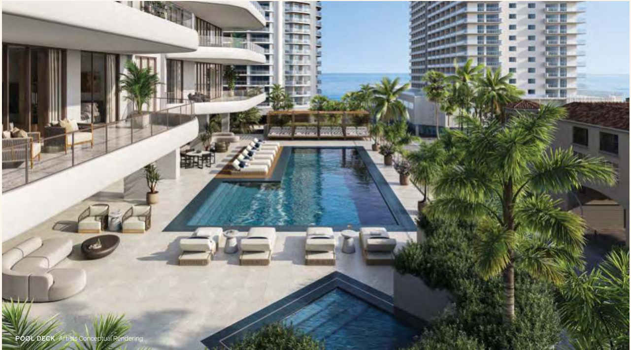
POOL DECK Artists Conceptual Rendering