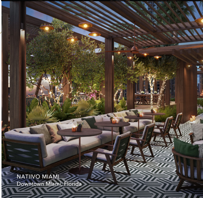
NATIIVO MIAMI Downtown Miami, Florida