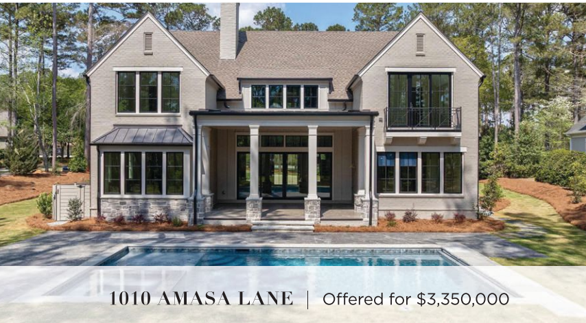
1010 AMASA LANE | Offered for $3,350,000