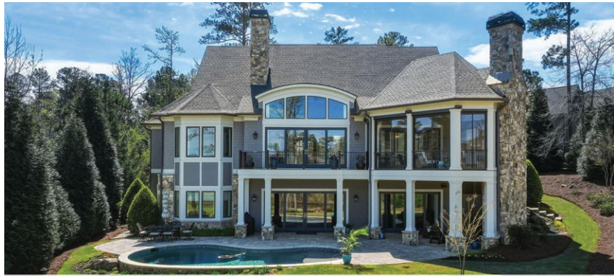
1240 ROSE CREEK | Offered for $3,650,000