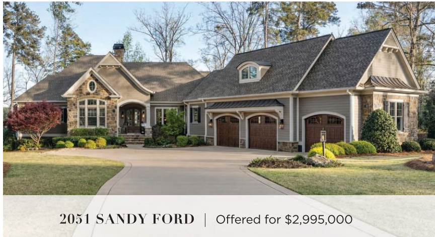
2051 SANDY FORD | Offered for $2,995,000