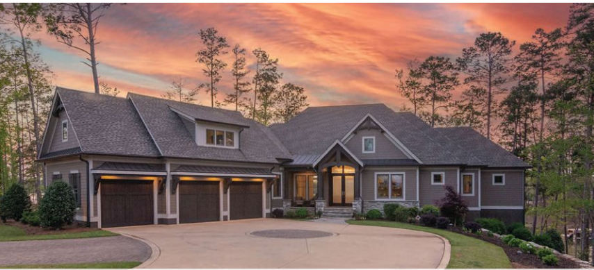
2751 LINGER LONGER DRIVE | Offered for $6,250,000