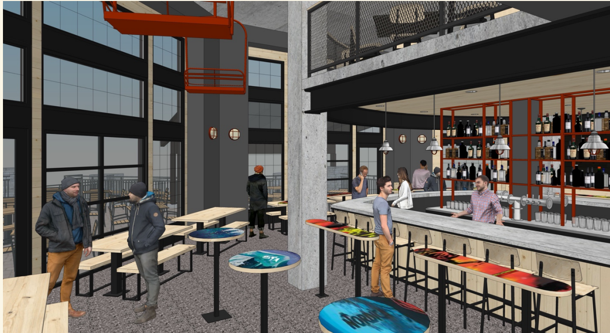
(Ground floor rendering of Seven Devils Taphouse bar)