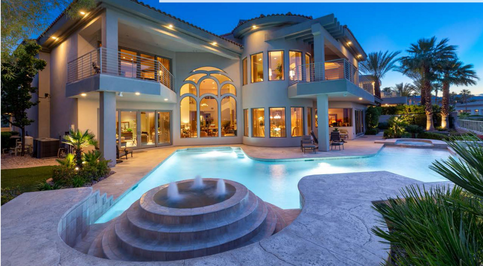
5130 SPANISH HILLS - CURRENTLY IN ESCROW - REPRESENTING SELLER