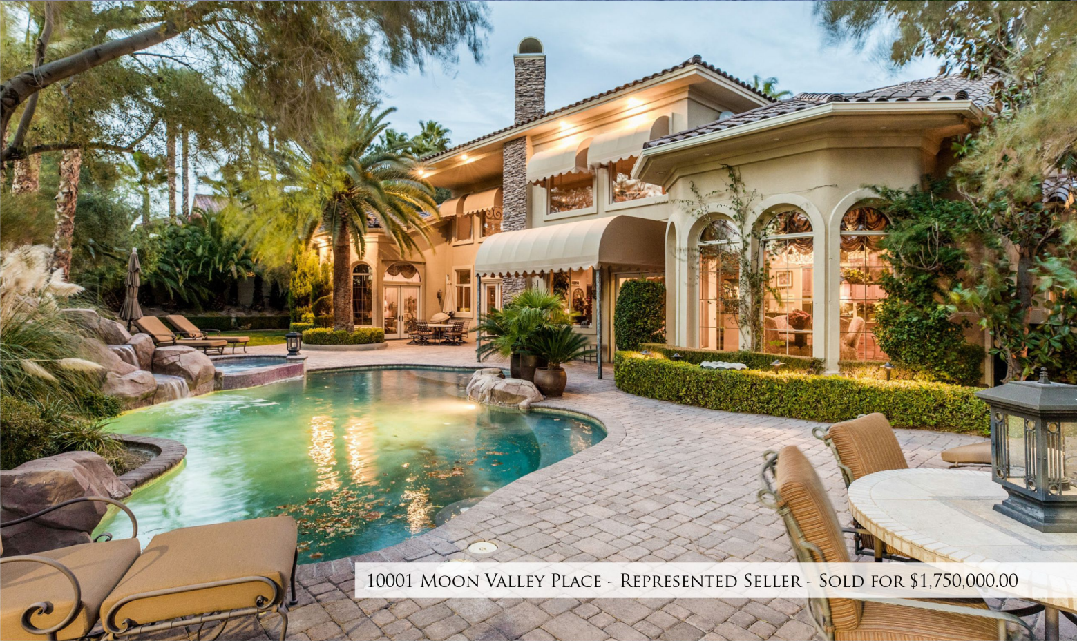
10001 MOON VALLEY PLACE - REPRESENTED SELLER - SOLD FOR $1,750,000.00