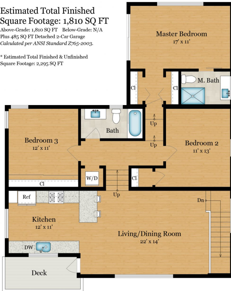
MAIN LEVEL 1,360 SQ FT

* Estimated Total Finished & Unfinished Square Footage: 2,295 SQ FT