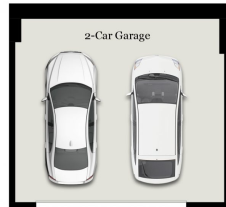
DETACHED GARAGE 485 SQ FT