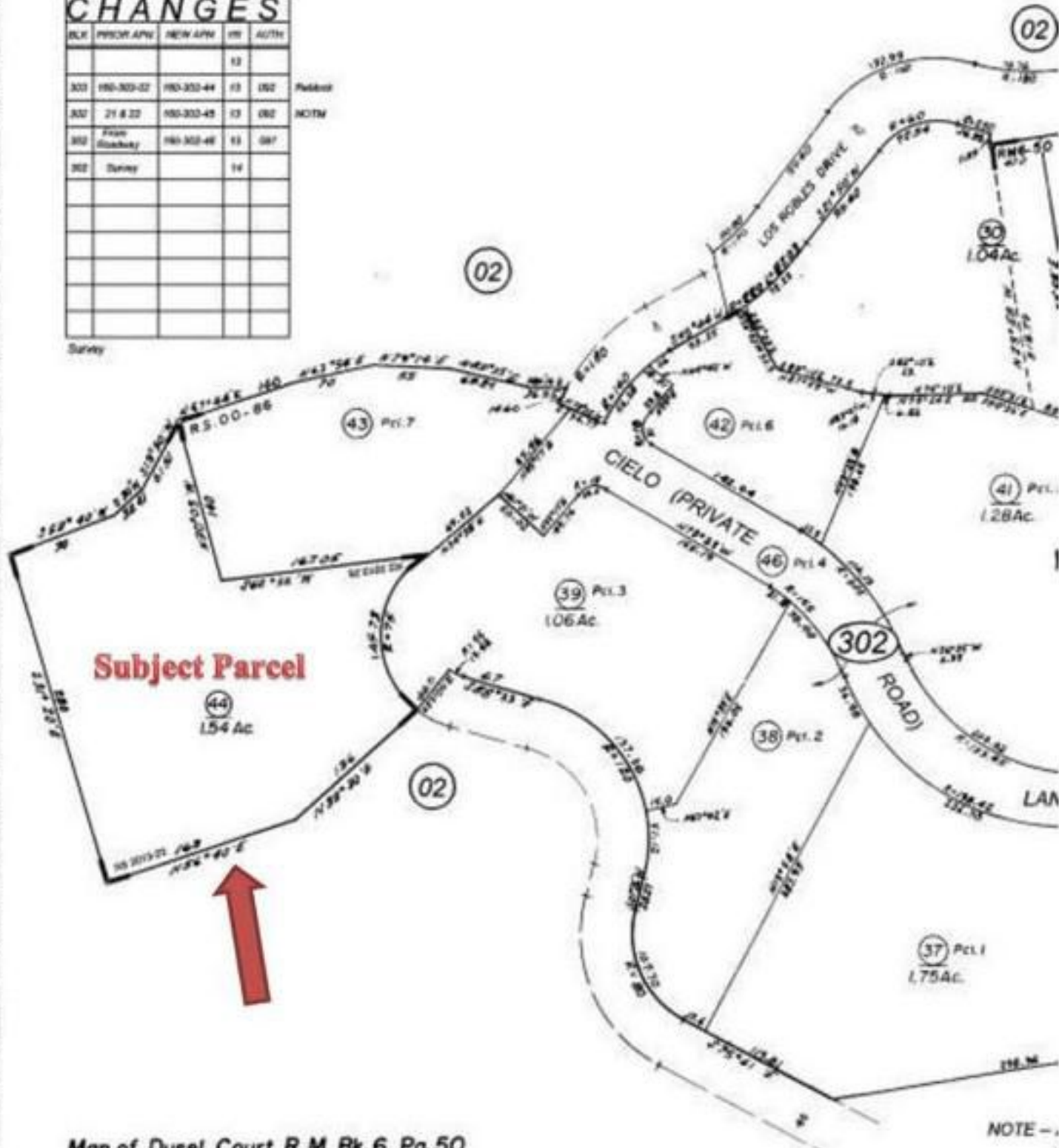
Map of Dusel Court R.M. Bk.6 Pg.50