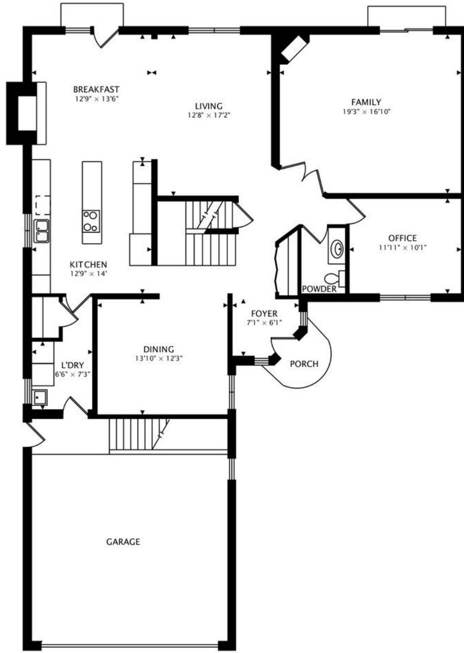
MAIN 1705 sq ft