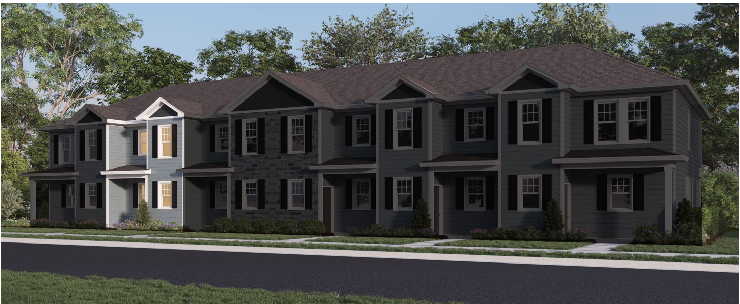
BUILDING B WITH STONE | SUSAN A

THE SUSAN • 1,459 SQ. FT. | 3 BEDS | 2.5 BATHS