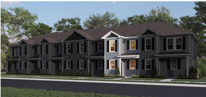
BUILDING B WITH STONE | SUSAN B

ELEVATION MATERIALS AND COLORS VARY PER COMMUNITY