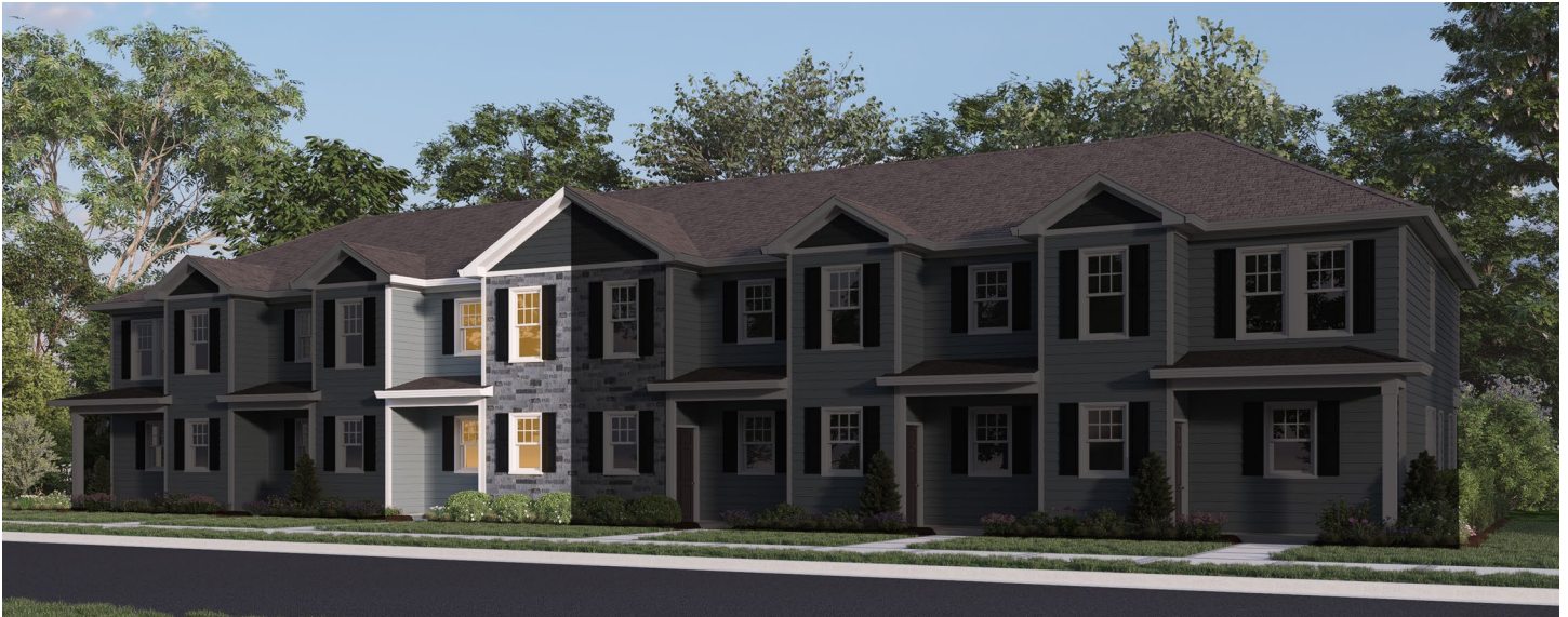
BUILDING B WITH STONE | SARA A

THE SARA • 1,033 SQ. FT. | 2 BEDS | 2.5 BATHS