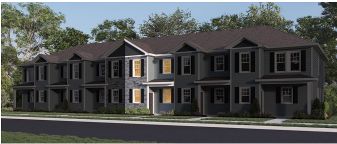
BUILDING B WITH STONE | SARA B