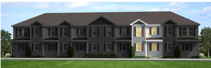
BUILDING A WITHOUT STONE | SARA D