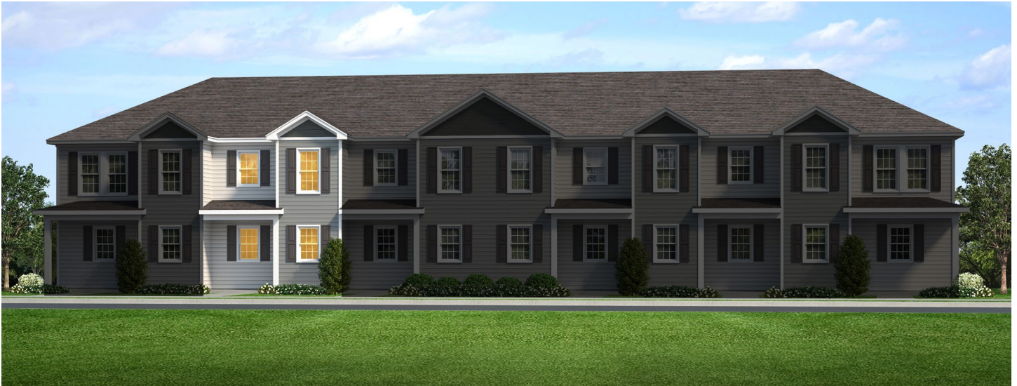
BUILDING A WITHOUT STONE | SARA A

THE SARA • 1,033 SQ. FT. | 2 BEDS | 2.5 BATHS