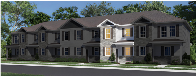
ELEVATION MATERIALS AND COLORS VARY PER COMMUNITY