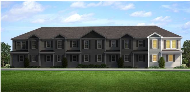
BUILDING A WITHOUT STONE | SHANNON A

ELEVATION MATERIALS AND COLORS VARY PER COMMUNITY