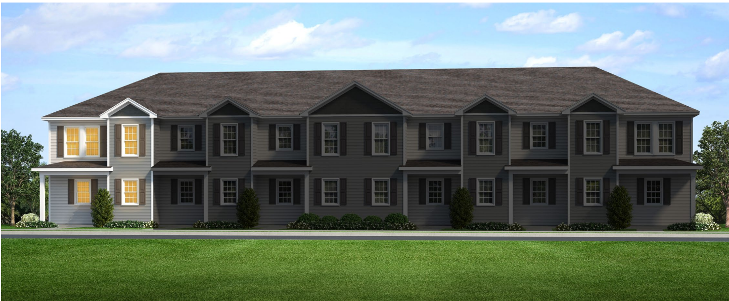
BUILDING A WITHOUT STONE | SHANNON A

THE SHANNON • 1,447 SQ. FT. | 3 BEDS | 2.5 BATHS