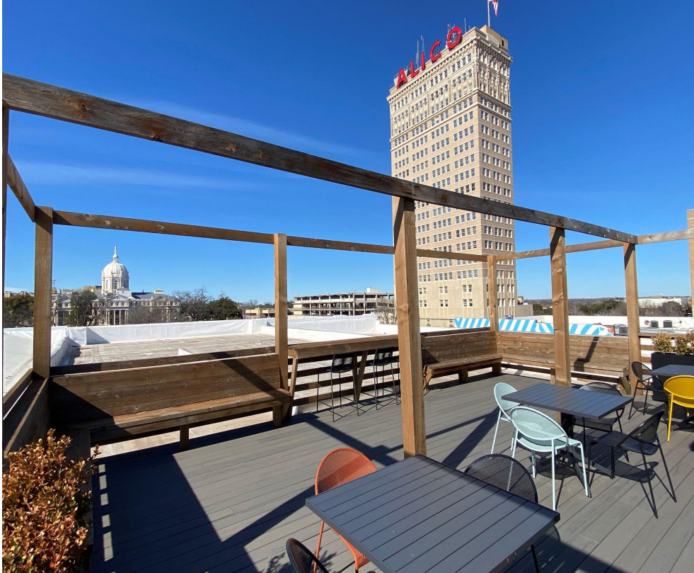
Terrace & Rooftop Break Area