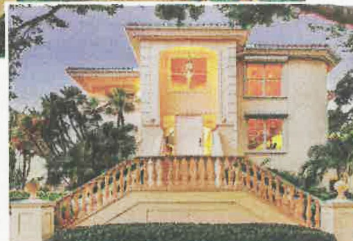
Middle Left: A private walk leads to the beach. Bottom Left: The front of the home overlooks the Longboat Key Club's Islandside golf course.