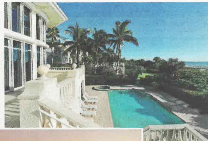
Above: The property, which is more than an acre, offers 134 feet of beach frontage.