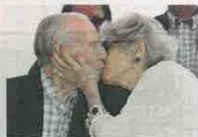
70 years later: Love. PAGE 2B