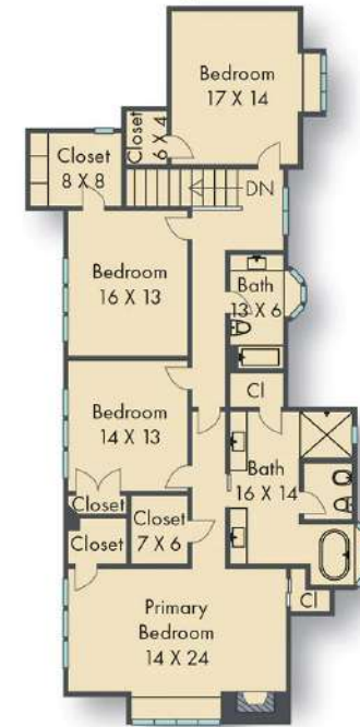
Main House Upper Level