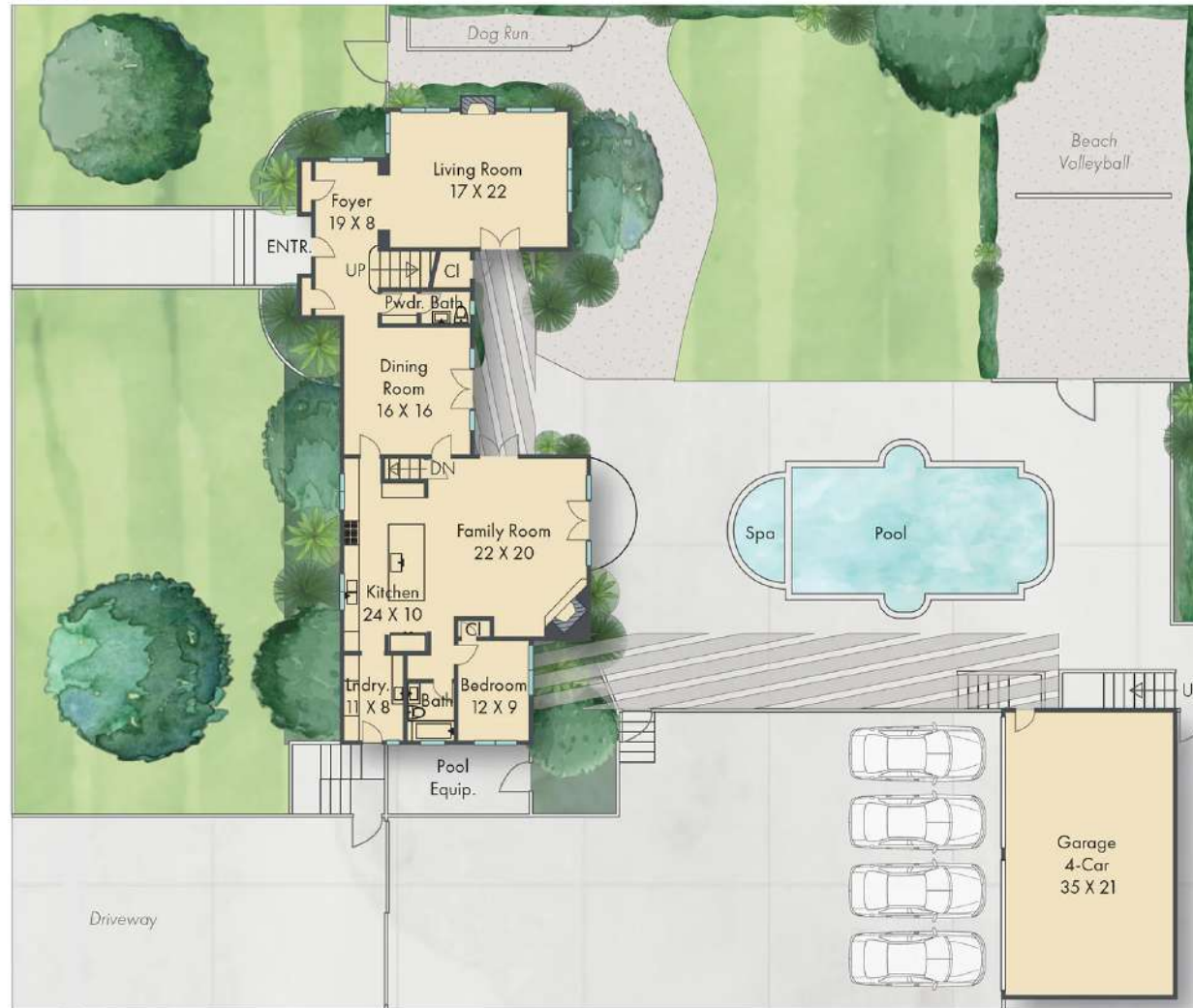
Main House Main Level